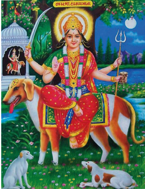
4. Hadkai Mata, Popular print, 20th century.