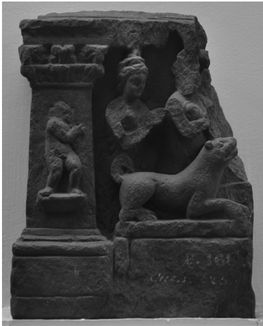
6. White Dog Barking at Buddha, Jamalgarhi, Gandhara, 2nd century CE, Indian Museum, Kolkata, Photo Biswarup Ganguly.