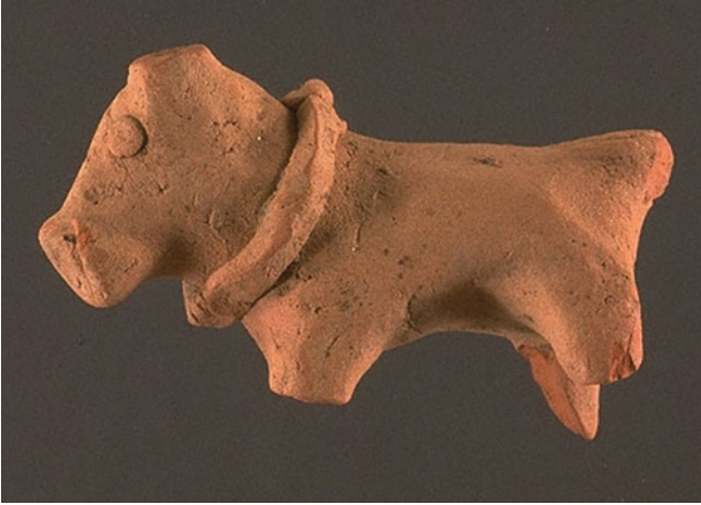
1. Dog, The Indus Valley Civilisation, ca. 2500 BC, https://www.harappa.com/blog/dogs-ancient-indus-valley