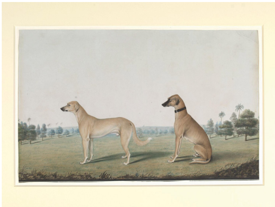
Fig. 15. Two dogs in the compound of a Calcutta house, Calcutta, ca. 1845, Victoria&Albert Museum, London, IS.6-1957.