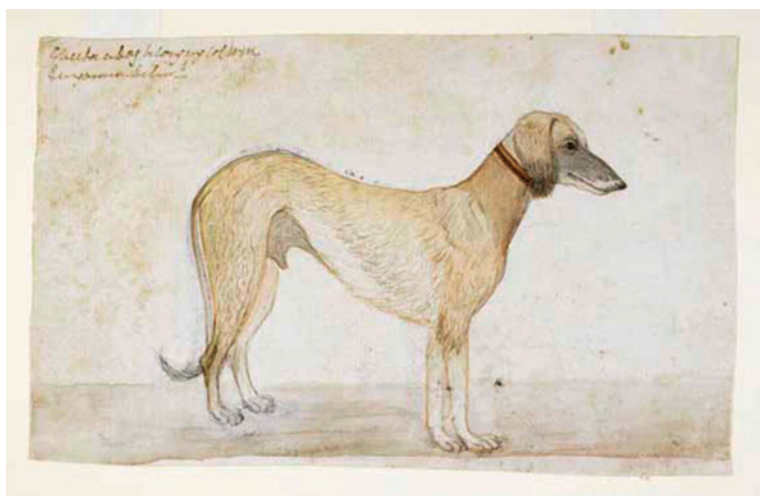
Fig. 16. A light brown saluki, By Gangaram, 1790. Inscribed above: Chuba a Dog belonging to CWM. Gangaram delint., British Library, Add.Or. 4146.