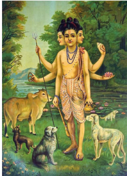
3. Raja Ravi Varma, Dattatreya, circa 1910, Printed at Ravi Varma Press, Malavli near Lonavala, Maharashtra.