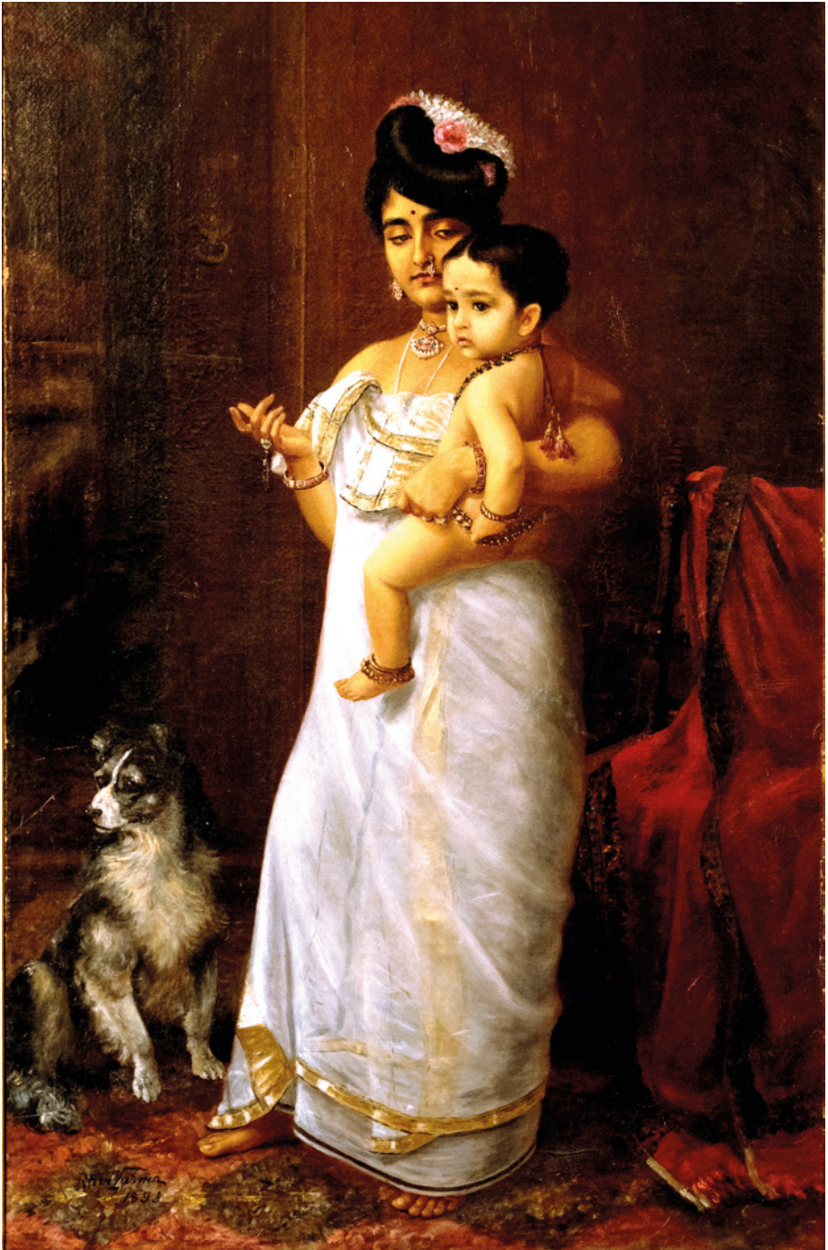
17. Raja Ravi Varma, There Comes Papa, 1893, Kowdiar Palace, Thiruvananthapuram.