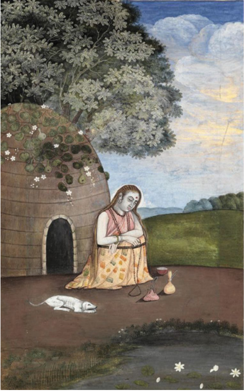
11. Yogini in Meditation, Murshidabad, c. 1760, Private collection.