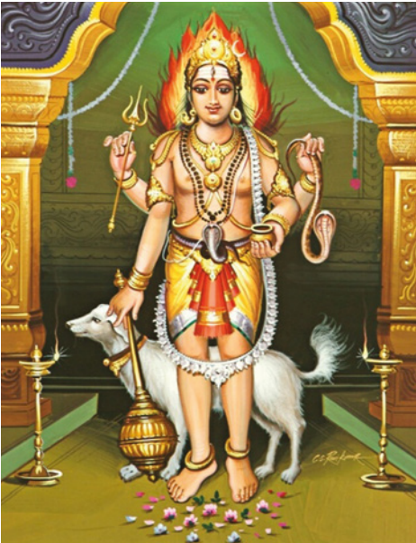
2. Bhairava, Popular print, 20th century.