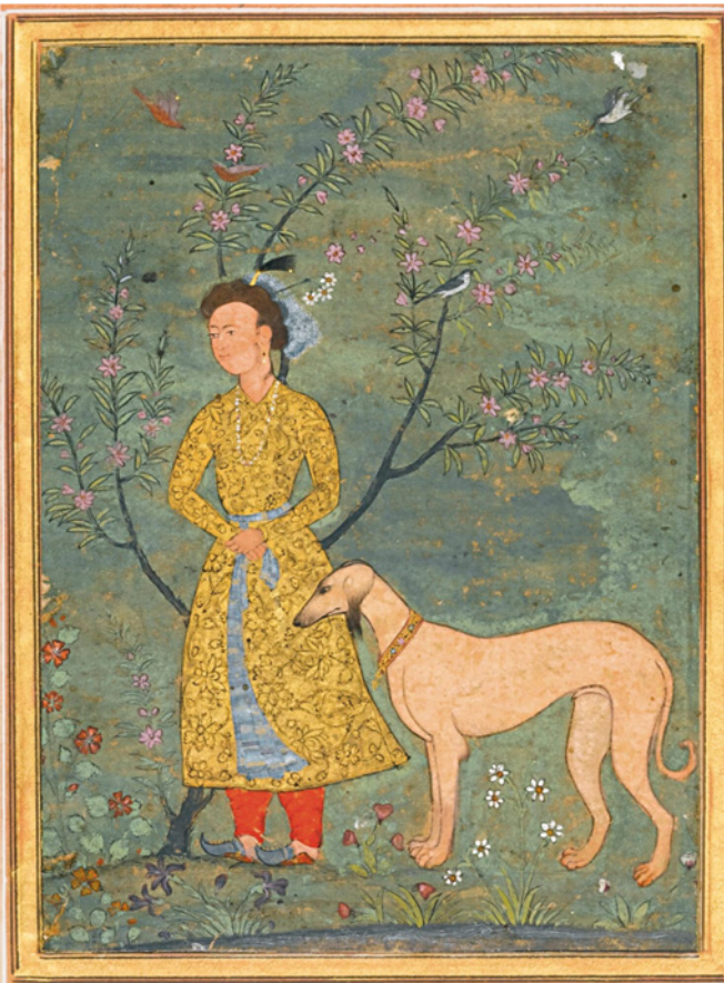
10. A portrait of a nobleman with a dog, attributable to a follower of Farrukh Beg, possibly Muhammad Ali, Mughal, early 17th century, Private collection.