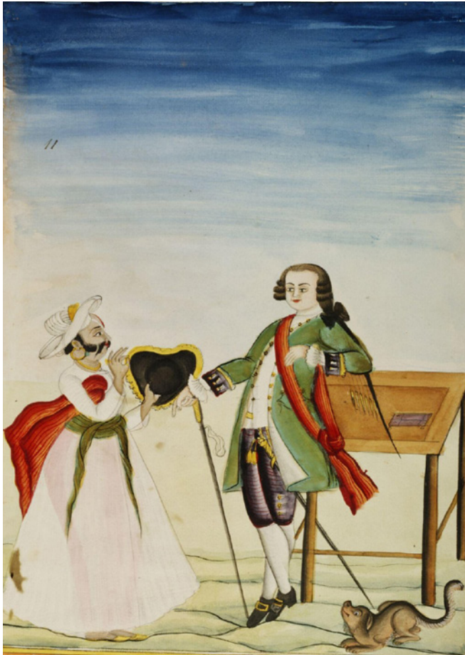
14. A French officer handing his manservant his hat, Madras, ca. 1785, Victoria&Albert Museum, London, IS.75:11-1954.