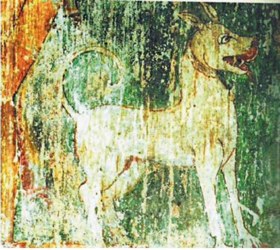
7. Alangu, Rajarajeswaram temple in Thanjavur, 1003 and 1010 AD., https://www.thehindu.com/news/national/tamil-nadu/chola-mural-tells-a-tale-of-dog/article6498185.ece