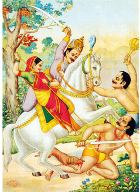
5. Khandoba and Mhalsa killing demons Mani-Malla. Ravi Varma Press. Lithograph by Chitrashala Press, circa 1880, Lithograph.