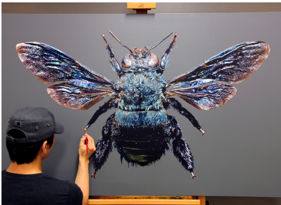
2. Kim Young-sung, Nothing. Life. Object series.