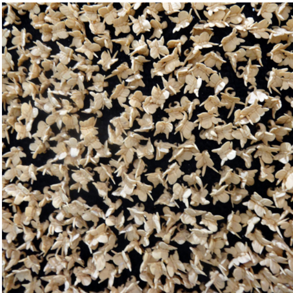
3b. Detail of Prosperity series