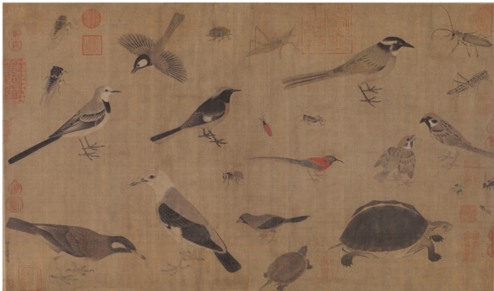
4. Huang Quan, Study of wonderful birds and other living creatures (Xie Sheng Zhen Qiu Tu) , the Palace Museum in Beijing.