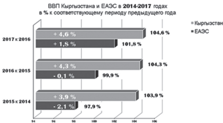
Figure 2. The GDP of the Kyrgyz Republic in 2014–2017

Kyrgyzstan is one of the leaders in economic growth among the EAEU countries according to Arzybek Kojoshev, the former minister of economics of the KR (Kojoshev, 2018). He also added that the inflation rate for the three-year period in the EAEU did not exceed 5%. The positive dynamics of economic growth in 2015-2017 (average 4%) is another good indicator. The average growth of turnover during this period was 15% and the garment industry was developing at especially fast pace.