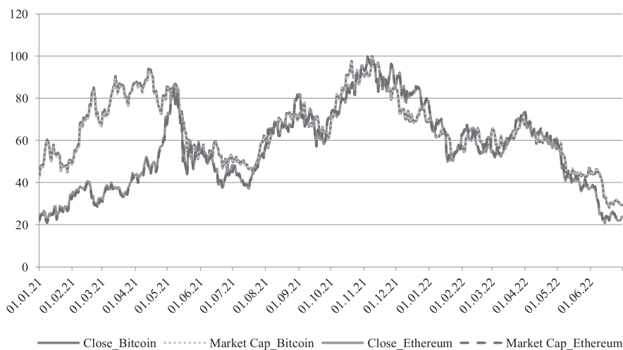
Figure 3. Standardized time series of Bitcoin and Ethereum quotations by Close and Market Cap categories in the period January 2021 – June 2022