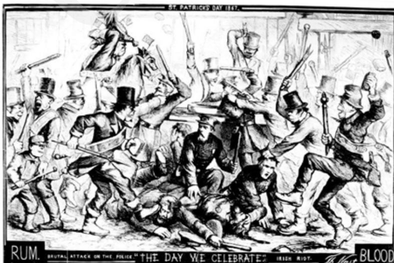
Figure 6. St. Patrick’s celebration that turned into riot ( Harpers Weekly , 1867)