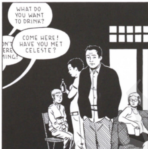
Fig 12. Tomine, A. (2012). Shortcomings . London: Faber and Faber, p. 52.

The final convention I want to point out is Tomine's way of showing how speech bubbles sometimes overlap and bleed into the text from other bubbles when protagonists interrupt each other: