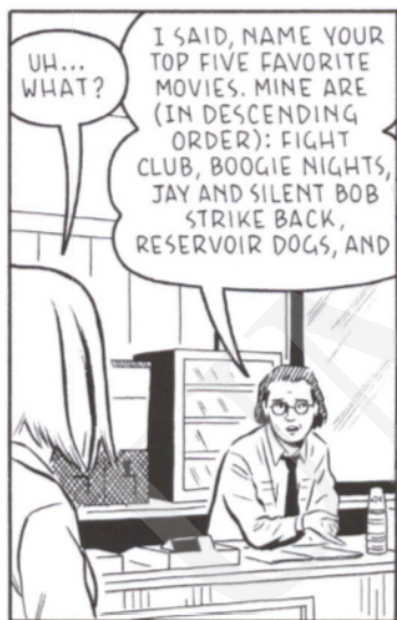
Fig 16. Tomine A. (2012). Shortcomings . London: Faber and Faber, p. 20.

Apart from the Zanettin's 'articulatory grammar' and the constraints it imposes, the language and cultural references pose challenges in Shortcomings . Allusions to other works appear; some of them are quite straightforward, as in the following frame: