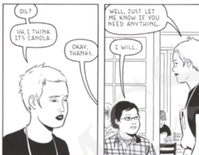
Fig 30. Tomine A. (2012). Shortcomings . London: Faber and Faber, p. 15.