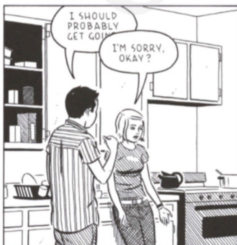
Fig 14. Tomine, A. (2012). Shortcomings . London: Faber and Faber, p. 50.

This convention was maintained in all cases but one: