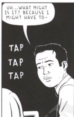
Fig 8. Tomine, A. (2012). Shortcomings . London: Faber and Faber, p. 58.

Another element of pictorial conventions exercised in Shortcomings is sound effects. Onomatopoeic expressions were ‘translated,’ i.e., replaced by echoic words which comply with Polish conventions, as exemplified by the following excerpts: