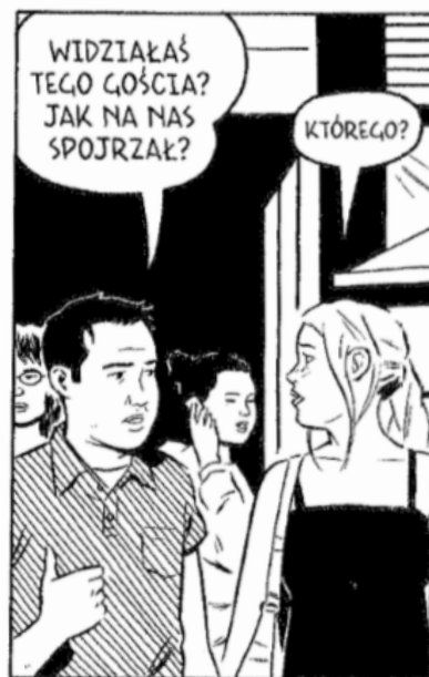
Fig 7. Tomine, A. (2010). Niedoskonałości . Trans: Murawska, A. Warszawa: Kultura Gniewu, p. 68.