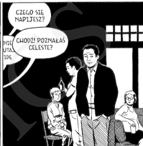
Fig 13. Tomine, A. (2010). Niedoskonalości . Trans: Murawska, A. Warszawa: Kultura Gniewu, p. 52.

This convention was maintained in all cases but one: