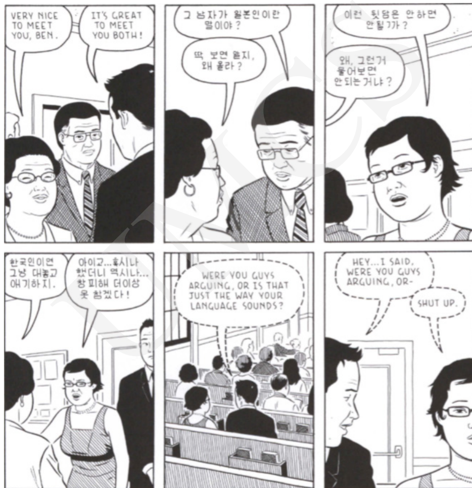
Fig 28. Tomine A. (2012). Shortcomings . London: Faber and Faber, p. 27.

The appearance of passages in Asian languages with no translation in the original is also important in terms of creating tension and depicting characters' emotions, as seen in the following excerpt: