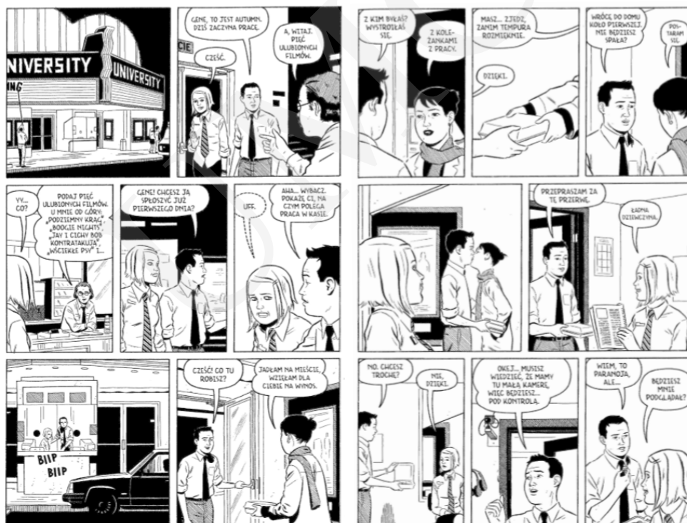
Fig 1. An example of a page composition in Tomine's Shortcomings .

Indeed, Tomine uses the comic book conventions in Shortcomings advisedly. The novel is characterized by formal minimalism and realistic depiction of diegetic space. Panels are of similar size and shape: always square or rectangular. There are six to nine of them on every page. Panel frames are regular, quite thin, unobtrusive. Breaches and bleeding out of panels never occur.