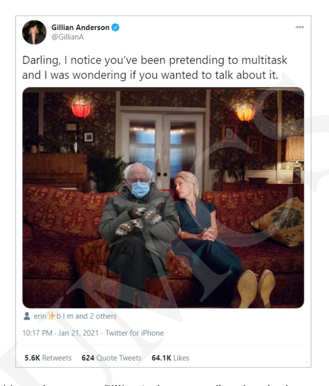
Fig. 6: Celebrities such as actress Gillian Anderson contributed to election memes spreading, sharing variations of "Bernie's Mittens"

depicted as "'cool' and culturally informed both in memes and ... fan writings" (2020) which are widely created and shared. This relatable image soon lost all political significance, becoming seemingly a floating signifier without clear meaning or reference. The iconic photograph of Bernie in his mittens was inserted into anything – from pop cultural imagery such as the Totoro meme<sup>6</sup> to the NASA rover landing – and reproduced in many media, be it deep faked video clips or as a crocheted doll.