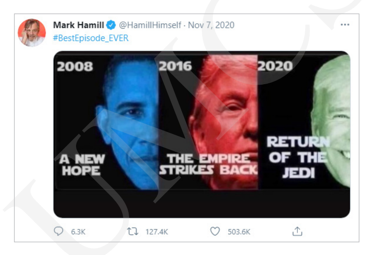
Fig. 2: The titles of the original Star Wars trilogy imposed on the American presidents from 2008 to 2020 (@HamillHimself, 2020).

Hence allusions to popular movies and TV shows form the base of many memes framing the weeks of the election week. Particularly references to such staples of geek fan culture as Star Wars , Marvel , and Game of Thrones were abundant, with even Mark Hamill, the actor playing Star Wars ' Luke Skywalker, sharing a highly popular meme after the election that was liked 500k times: