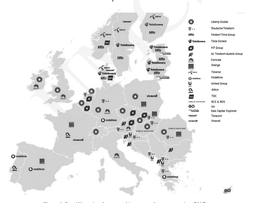
Figure 1. Pay AV services by ownership, geography segmentation (2017)

Figure 1 shows how closely the markets in each Member State are interconnected through the largest service providers. It is clear that most consumers in the Member States are fighting for the majority of consumers, that means that in most cases we can talk about limited competition.