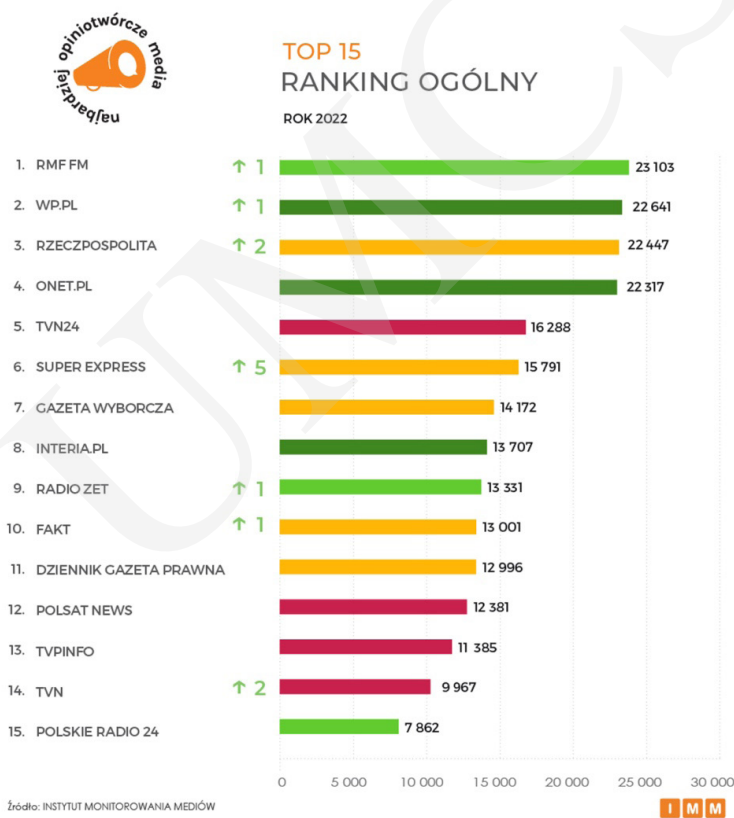
Figure 2. Results of press citations research – general ranking