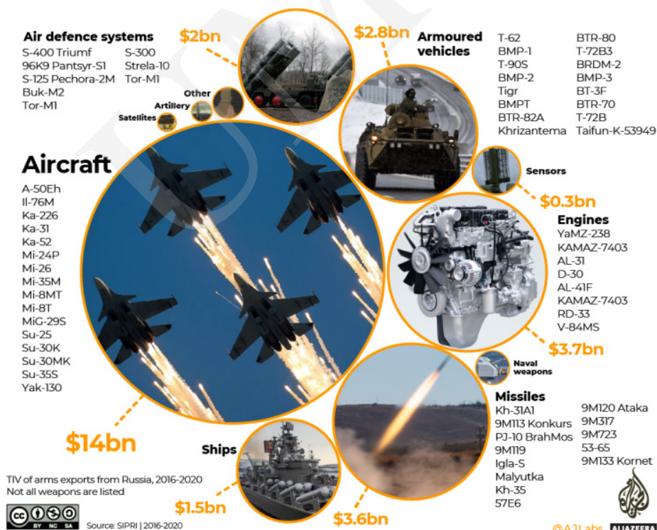
Fig. 2. Types of Weapons, which Russia exported to the International Market within 2016–2020

Half of Russia’s arms exports are aircraft. Many Russian weapons are upgrades to its Soviet-era arsenal but it is developing more advanced systems . Between 2016 and 2020, Moscow sold $28bn of weapons to 45 countries.