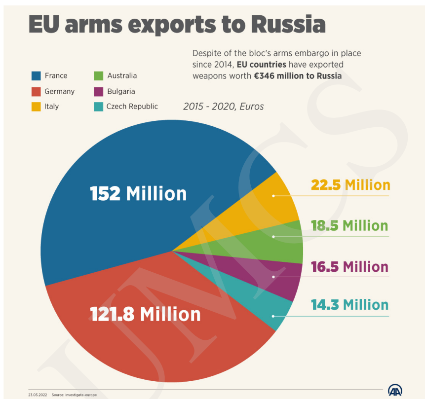
Fig.3. EU Arms Exports to Russia within 2015–2020