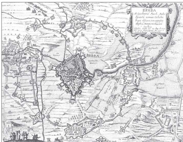
Figure 3. A drawing of the siege of Breda, which was sent by Krzysztof Arciszewski to Krzysztof Radziwiłł

is also a bottleneck which the Spaniards created to protect themselves from the approaching relief, as detailed in the letter. 50