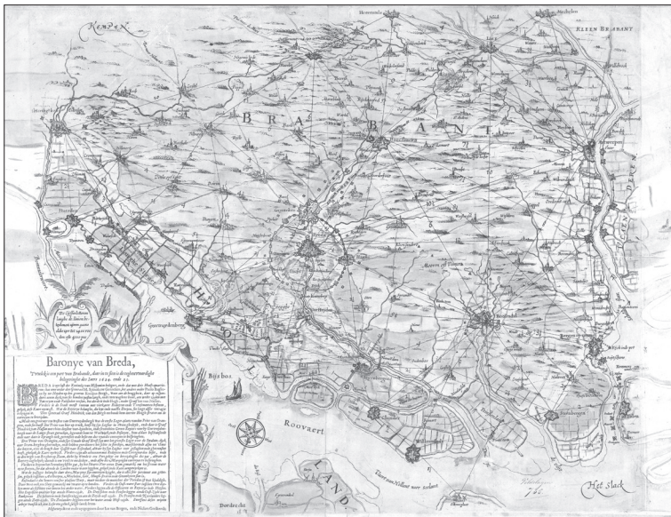
Figure 4. A map of the Breda area sent by Krzysztof Arciszewski to Krzysztof Radziwiłł

ence shows integrated spatial thinking combining tactical maps with medium and large-scale maps. The title of the work is not given. However, if we take into account the fragment in which the author writes that on the sent map there are recorded distances between cities, it is likely that the archetype or the drawing of Baronye van Breda Niclaes Geelkercken itself is mentioned (Figure 4). 52 This belief is also confirmed by the fact that Geelkerck was personally present at the siege of Breda, and this map was ordered for the Dutch army. 53 So Arciszewski had easy access to it.