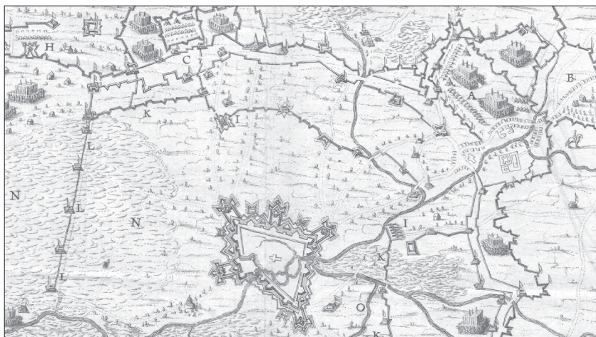
Figure 5. Fortifications, the construction of dykes and floodplains and the Breda fortress and surrounding camps

Theodora Galle, Obsidio Bredae Perfecta , in: H. Hugo, Obsidio Bredana armis Philippi IV. auspiciis Isabellae duct Ambr. Spinolae perfecta , Antverpiae 1626, p. 126 (extract).