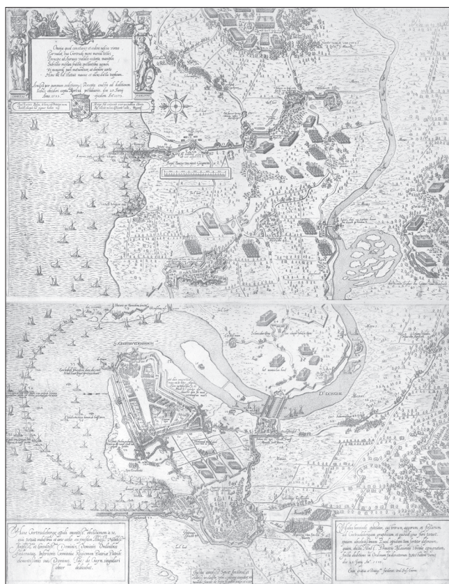
Figure 1. Siege and capture of Geertruidenberg from 1593. Figure Jacob de Gheyn (II) based on a drawing by Giovaia Battista Boazio, text by Petrus Hogerbeets (700 × 550 mm)

to the city from the coast (Figure 1). 16 As a result, the Spanish crew capitulated after a two-month siege. Willem Lodewijk van Nassau-Dillenburg assessed the contemporary events that the methods and actions of war used at the time went beyond primitive violence, and this siege is a clear example of the use of science and ancient martial techniques, which had been ridiculed by many commanders before. 17