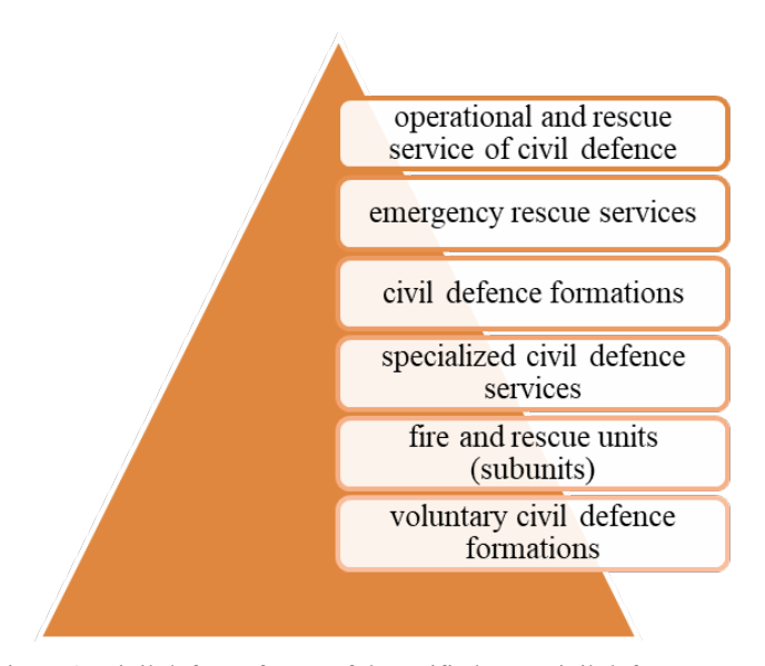
Figure 3. Civil defence forces of the unified state civil defence system