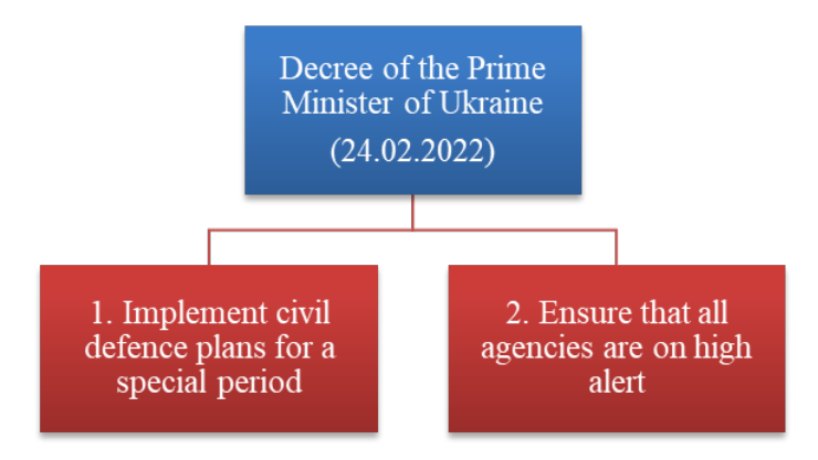
Figure 4. The decree of the Prime Minister of Ukraine on the day of Russia's full-scale military invasion

On the day of Russia's full-scale military assault on Ukraine, the Prime Minister of Ukraine issued a decree (figure 4).