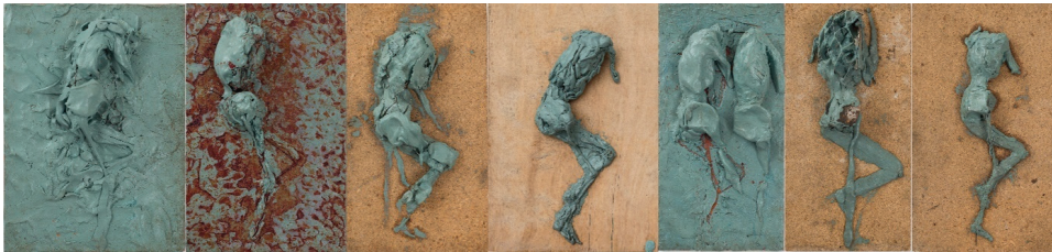
Figure 1. Nude Study (1991), wire, modelling clay, cabinet: glass, wood

Through the imprints of the human body, I am attempting to solidify the fleeting moments of life, its paradoxes and absurdity in the transparent polystyrene [...]. Of all the manifestations of the ephemeral, the human body is the most vulnerable, the only source of all joy, all suffering and all truth (Szapocznikow 1972, according to Leśniewska 2021: 42).