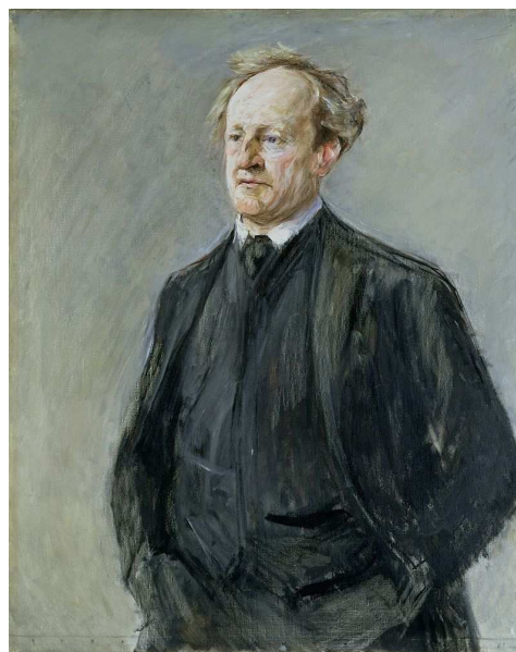
Photo 2. Portrait of Gerhart Hauptmann

The museum presents the very interesting history of Hauptmann's life (especially his declining years). He was a poet, a playwright and a socialist writer, a Nobel Prize laureate, a rich man, a traveller, a rebel, a celebrity and above all a German citizen, who after World War II found himself in the area of the so-called 'Recovered Territories'. With the permission of secret police (NKVD) and the emerging new Polish authorities in Silesia, he