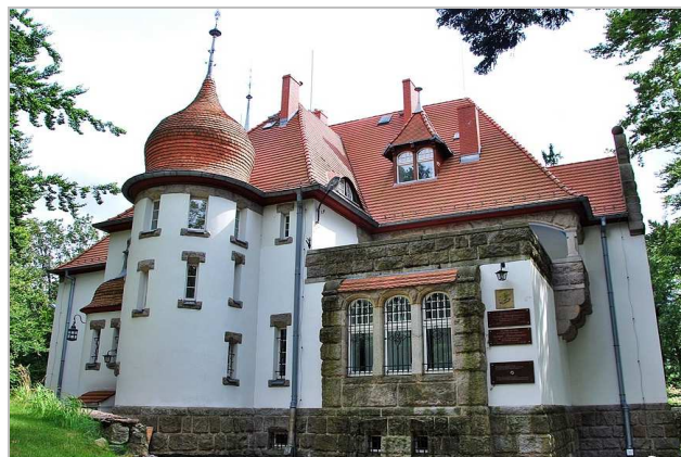
Photo 1. The Gerhart Hauptmann Museum in Jelenia Góra-Jagniątków

ing example of residential architecture, combining elements of historicism and the neo-Renaissance. It was listed among the historical monuments of Jelenia Góra region in 1985 and, with its decor and furnishings as well as the surrounding park, constitutes its primary purpose – the most important resource of the museum.