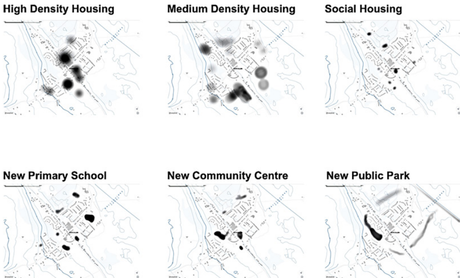
Fig. 4. Collective mapping

Housing is distinguished by type. All respondents were guided as to the possible level of future growth for the village and their visions as to what type of housing and where that housing was situated is shown here. High density housing (the most often chosen type of housing) was generally sited in the village centre on vacant lands. The density of housing lowers as we move away from the village centre. Note the inclusion of social/ community/ care housing which is also situated in proximity to the village centre. In general, as with other elements of this exercise, there is some evidence of the wisdom of crowds, the above patterns tantamount to a well planned housing development for the village.