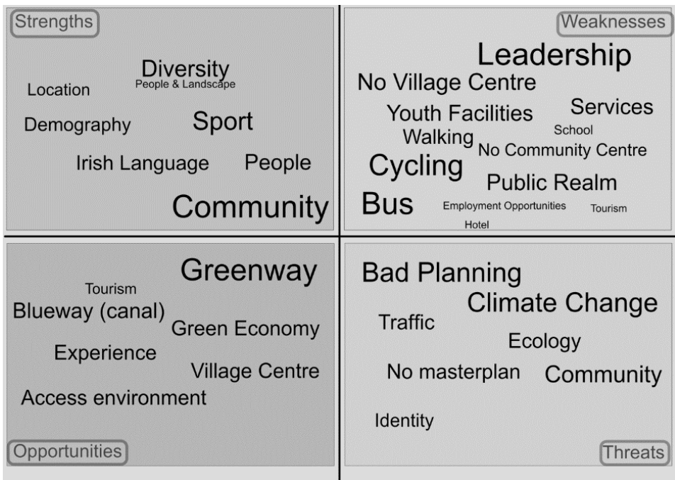
Fig. 1. SWOT Analysis

This has been reflected in focus group work and the results of the SWOT analysis that are represented in Fig. 1. Again, community features strongly and is highly ranked as a distinct strength of village in all focus groups. Interestingly, when participants were asked to project forward and envisage what were the broad threats in future development, they also highlighted community as susceptible in future growth scenarios. The Irish language, as well as the demographic composition of the village, were highlighted as strengths. The young, diverse and well-educated residents of the village were seen as important factors to build on as it grows.