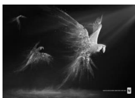
1a The Parrots 1

The first group of the analysed advertisements had been developed within the framework of the campaign against desertification (cf. example in Fig.1). The campaign released in 2011 includes three adverts, which feature the animals, i.e., the parrots, the leopard and the elephant respectively, being frozen in motion. The animals are illuminated as if being in the spotlight and are gradually turning into dust, thus, becoming extinct after losing their habitat as a result of desertification caused by climate change. The SPOTLIGHT IS simultaneously the SCORCHING SUN and an attention-trigger to the environmental issue under question.