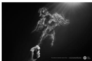
Figure 9: Advertising campaign against the use of animals in experimenting and scientific research 16

is carried by a woman, stands for killing and is the visual representation of the source domain. Without the text one may come to a faulty interpretation of the ad concluding that it is the suitcase that is made of genuine leather, thus, coming to the conclusion that it is a campaign against animals being used for manufacturing clothing and accessories. However, the intended message and the aim of this advertisement is to stop people buying (or giving as presents) exotic animal souvenirs, which is consequently posing a threat to nature and wildlife.