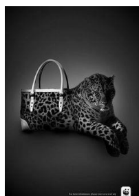
2a The Leopard Handbag 4