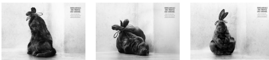
Figure 5: Advertising campaign against pets’ maltreatment 11

Integrated type of visual metaphor is employed in the advertising campaign against maltreatment of pets (cf. example in Fig. 5). The underlying metaphor in these advertisements is PET IS GARBAGE BAG.