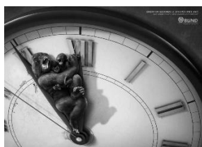
3a The Gorilla 6

The use of the contextual type of visual metaphor is exemplified in the following series of advertisements (cf. example in Fig. 3) created within the campaign to raise funds for the preservation of various species, i.e., fighting against animal extinction.