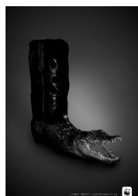
2b The Crocodile Boot 5