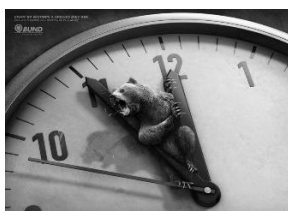
3b The Brown Bear 7