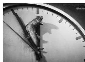
3c The Seal 8