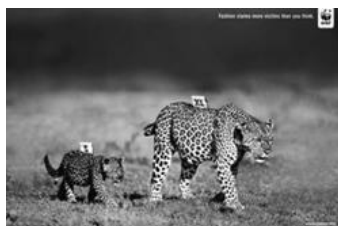
6a The Jaguar 12

Another set of advertisements with integrated metaphors are the adverts that evidently aim at encouraging people to preserve nature and campaigns against using natural fur coats (cf. example in Fig. 6).