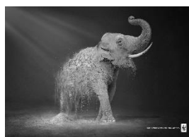
1c The Elephant 3