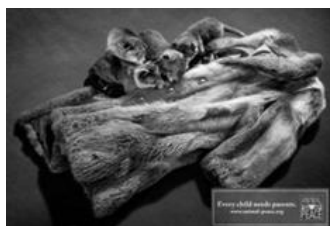
6b The Fox 13