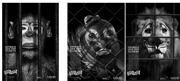
Figure 4: WWF advertising campaign against animal exploitation in circus 9

Another example of the use of contextual visual metaphor is employed in the campaign against the exploitation of animals in circuses (cf. example in Fig. 4).