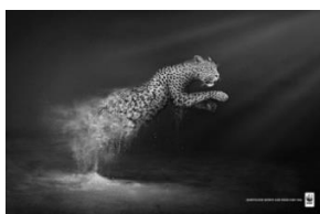
1b The Leopard 2