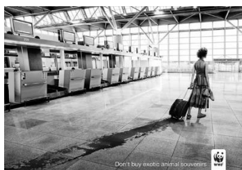
Figure 8: WWF advertising campaign against exotic animal souvenirs 15

The advertisement against animals treated as souvenirs is yet another token of a multimodal metaphor (cf. example in Fig. 8).