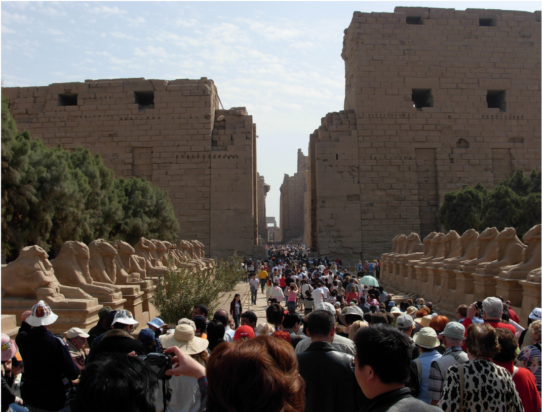
Fig. 1. The temple of Karnak as an example of a strongly tourist-loaded reception area.