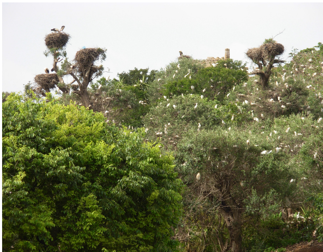
Fig. 3. Bird populations affected by similar factors as can be found for human populations.

lated per individual. In turn, the right side expresses this speed as a product of two factors: r and (1 - N/K) . If r only was on the right, the equation would represent the well-known Malthusian Equation dating back to 1798. Despite the assumptions made in the Malthusian model, which are some approximation of the reality and as such do not give rise to any greater objection, at first sight, the solution to such an equation is, however, paradoxically unrealistic, showing exponential, unlimited population growth. In fact, such an increase is not possible (Pianka 1981), although in a short term this solution may reflect the behaviour of real populations (initially, this is how the solution of the logistic equation behaves, which will be discussed later). Against this background, a fundamental ecological question arose, what are the reasons for deviating from such a growth (Hastings 1997). Malthus