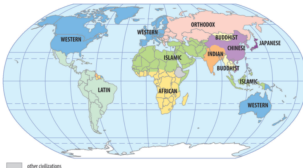
Figure 1. Civilizations according to Huntington (1996). Note: partly modified; scale 1:260,000,000.