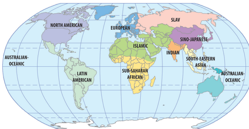
Figure 3. Culture realms according to Fellmann et al. (2008). Scale 1:260,000,000.