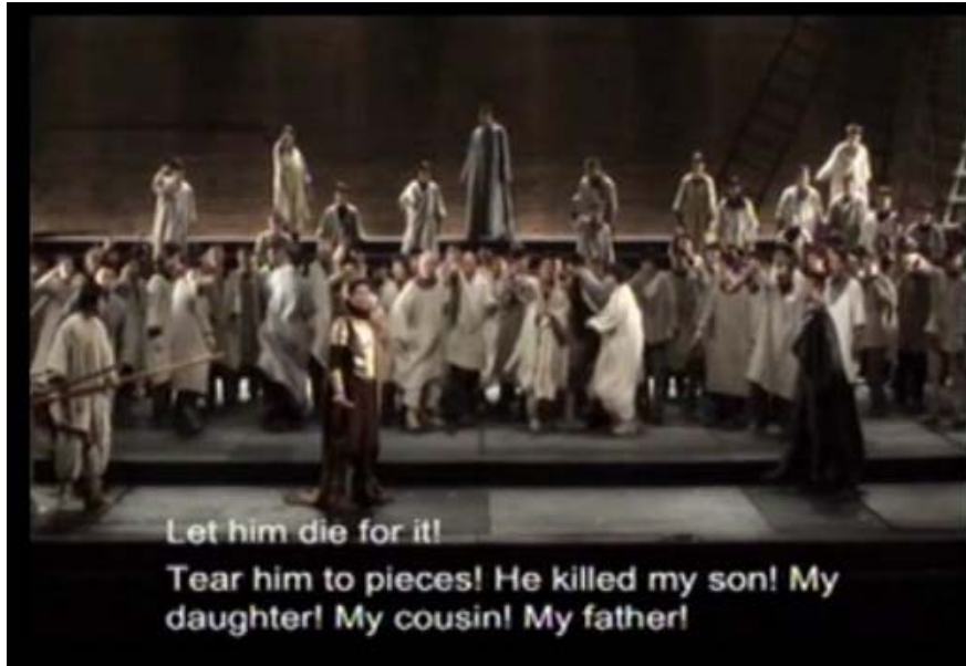
Migrant workers as the citizens confront Pu Cunxin as Coriolanus from the 2007 production at the Beijing People's Art Theatre 'Coriolanus'