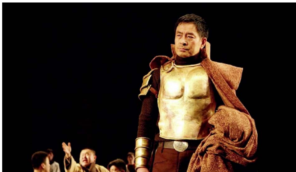
Actor Pu Cunxin as Coriolanus from 'Chinese Coriolanus at Edinburgh Festival'