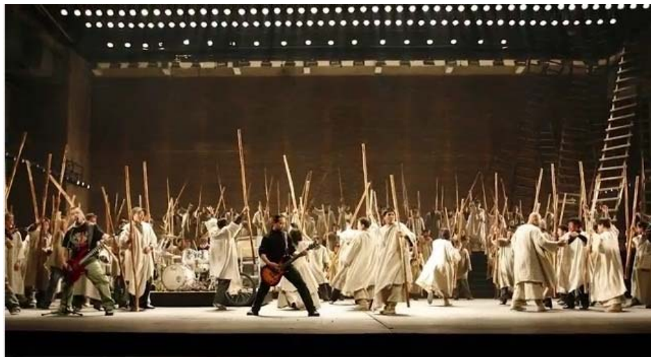
Cast and musicians, 'Coriolanus' from '2013 The Tragedy of Coriolanus' YouTube posted by EdintFest. Available from http://www.youtube.com/watch?v=MjKaUmLvQII