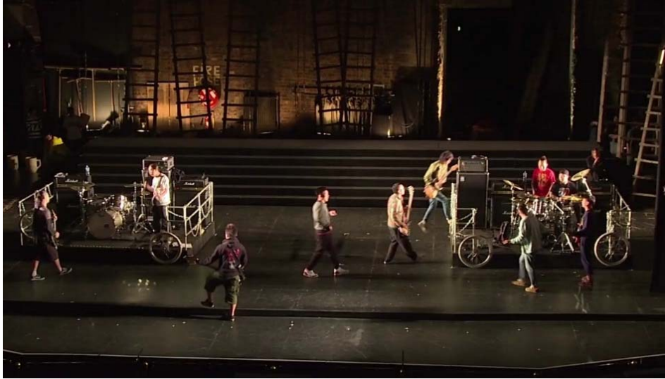
Beijing bands Suffocated and Miserable Faith in rehearsal in Edinburgh from 'Chinese Coriolanus at Edinburgh Festival' Vimeo posted by KT Wong Foundation. Available from http://vimeo.com/73625869 [accessed 17/03/2014] Moving image