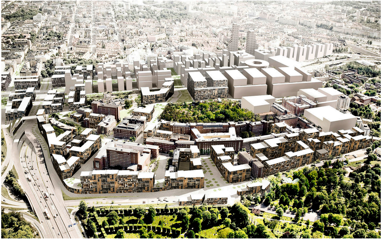
Fig. 3. Vision and imagery of Stockholm's Norra Hagastaden. Courtesy of RUNDQUIST ARKITEKTER AB.

in China, UniCredit Bank Austria Campus and The Erste Bank Campus in Vienna and many others of its kind. All projects rest on the same premise: projects include massive square meters of residential areas, commercial and office areas, and other supporting facilities, such as parking, shopping, sports, schools, higher order social facilities, expanded multi-modal stations, cultural attractions, green areas, and even world-leading research in forms of either clusters, innovation districts, living labs or connections to business improvement districts (Figs 1-3). Architecture is seen as a medium that fits smoothly into the historic and natural spatial context of the city. Using retail to remake urban mixed-use environments is also seen as a possible anchor in this paradigm, which makes it a market urbanism variance. Finally all projects are strongly anchored to transit oriented development plus office concepts are designed to cater for a new corporate culture.