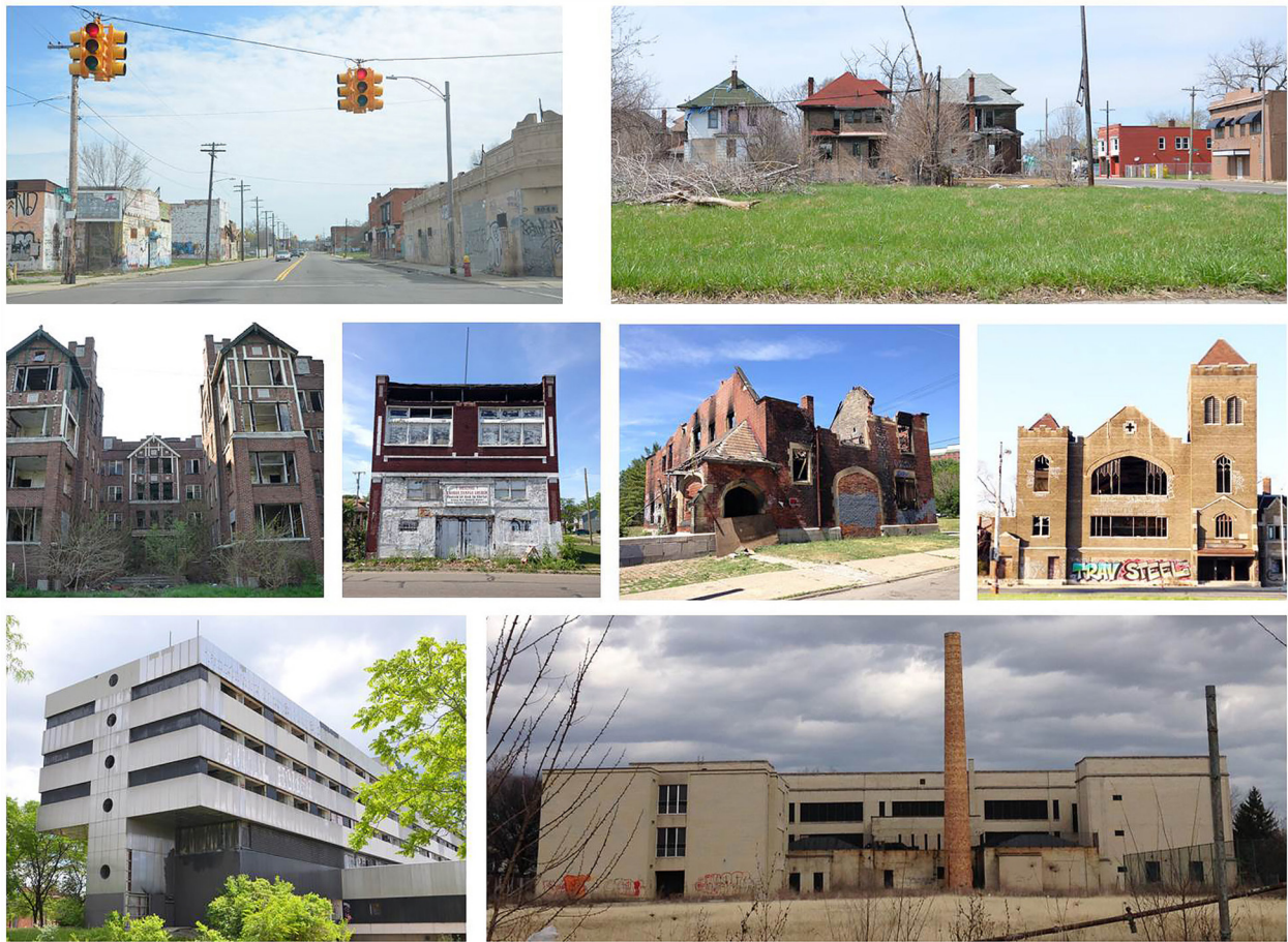
Fig. 5. Abandoned buildings and blighted landscapes showing the effects of the fourth migration. Images by authors.

rebuilding the city, including the rehabilitation of existing structures, construction of new structures, revitalisation of public places, and transit oriented solutions, taken together, exemplifies ReUrbanism. While many actors within the private and public sector converge in the rebuilding of Detroit, two well-known billionaire personalities and their associated corporations have been linked with the “Rebirth of Detroit”. Dan Gilbert and his real estate firm Bedrock owns 60% of the land in Downtown Detroit, 90 properties in the urban core, and 1.4 million square meters (Larson 2017; Kiger 2018). North of the Downtown, in what was long known as the Lower Cass Corridor, the Ilitch family and their real estate firm, Olympia Development of Michigan dominate the map. This has created a situation of extremely concentrated land ownership by these two billionaires and their companies, who have largely become the new master-planners of post-bankruptcy Detroit. In effect, their visions for the city have become the gold standard due to two main reasons.