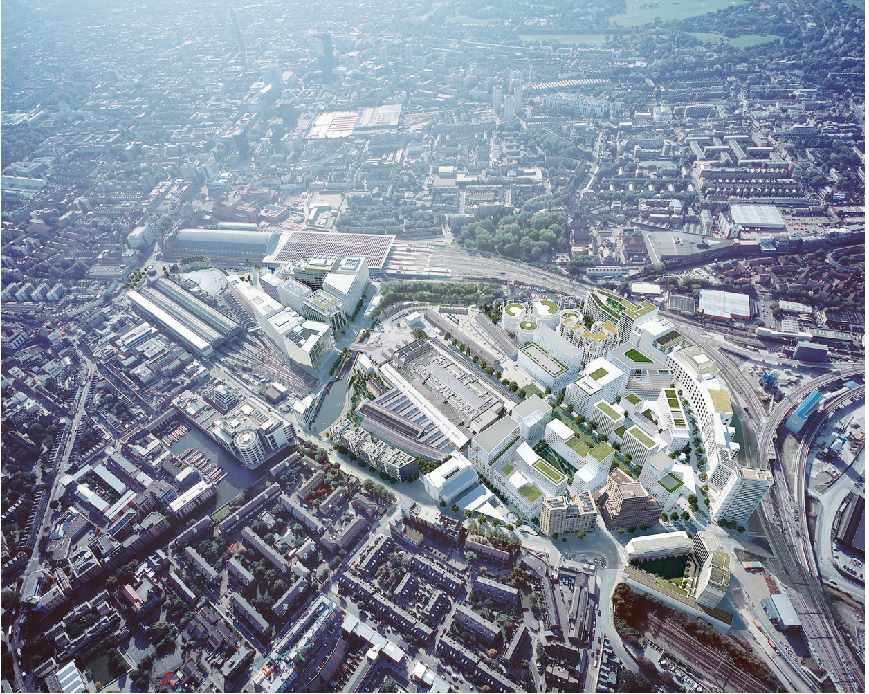
Fig. 2. King's Cross is a mixed-use, urban regeneration project in central London (KCCLP). Courtesy of RUNDQUIST ARKITEKTER AB.

urban designers have to understand complex connections throughout the urban fabric while being sensitive to context and resources at the local level as a prerequisite of their intervention (Campbell, Cowan 2002). Building on these previous descriptions, we see ReUrbanism as a rational urban planning and design approach where the city is seen as an addition or complement to the constant urban fabric within existing building stock, where it produces density and stable conditions throughout the space enabling a complex set of spaces to come together in a contextualised, programmatic and complete manner .