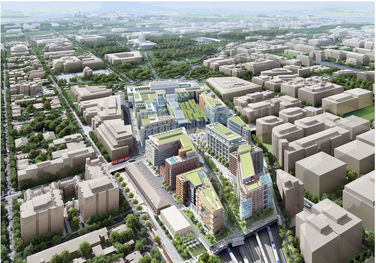
Fig. 1. Vision of Burnham Place Union Station, Washington DC.