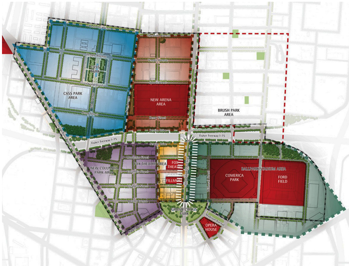
Fig. 6. Rendering of proposed District Detroit.

District Detroit”, a sports and entertainment district which promises to bring new residential, office, retail and restaurant space in addition to the construction of a new sports arena, already completed. The development is by the Ilitch family and their company, Olympia Development. Crain’s Detroit Business Journal called it “a dramatic transformation in the heart of Detroit”, with the headline: “the Ilitch family breaks ground on a $450 million dollar arena with another $200 million in apartments, restaurants, office buildings, parks and shops over 45 blocks. This is the city’s entertainment district, super-sized” (Shea 2014a). By the time the arena was completed in 2017, the cost had nearly doubled to $863 million. President and CEO Chris Ilitch described Detroit as “an investor’s playground” and proclaimed “this project takes on a much bigger scale. There is nothing like this going on in our country” (Shea 2014a). Overall, the developer refers to it as an investment of $1.4 billion to act as a “driving catalyst of the city’s remarkable resurgence”