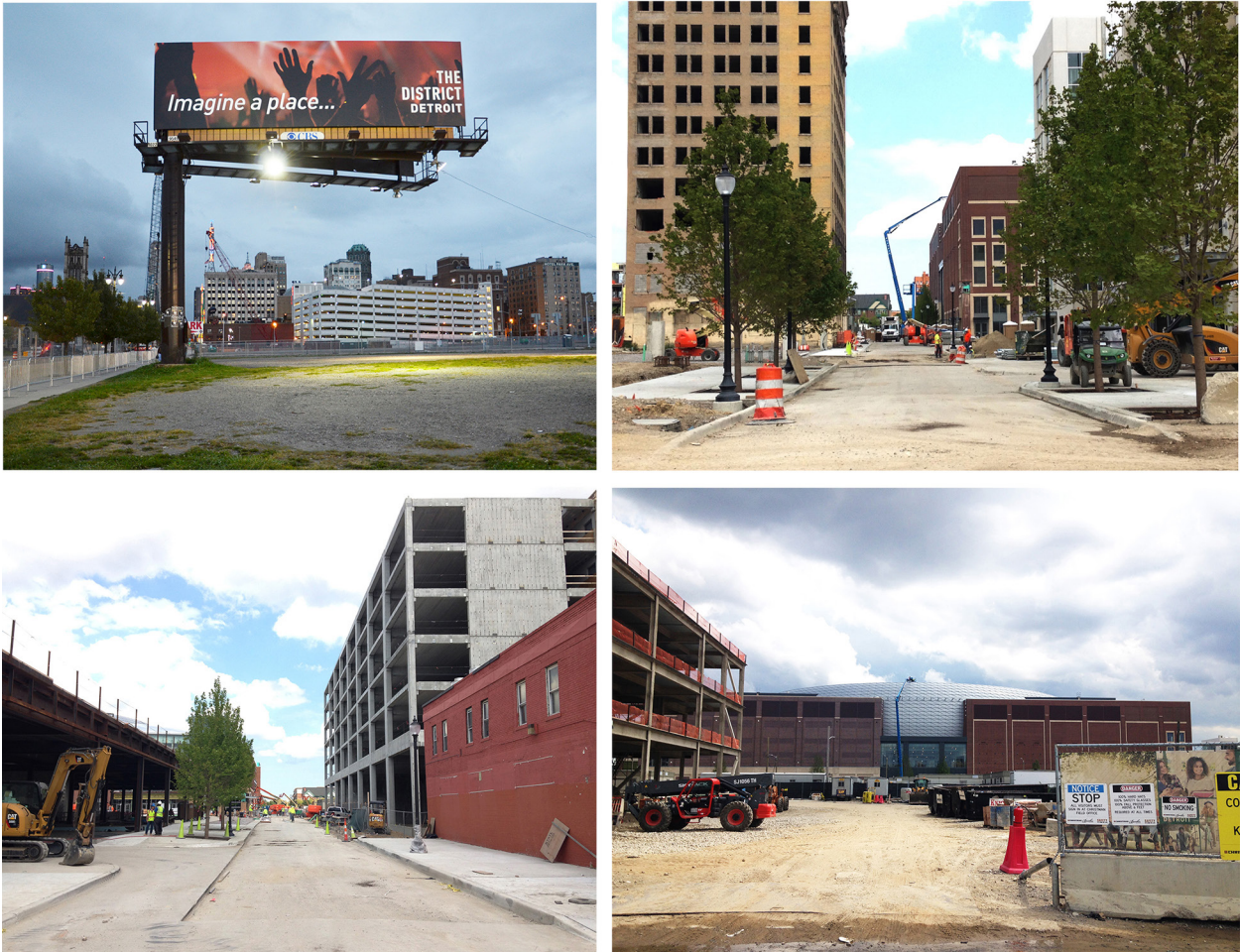
Fig. 7. The District Detroit takes shape, top left March 2014, all other images August 2017.

out space in the urban-isms to reintroduce and redefine this in order to allow for the naming of this type of global urban development, which can open the road to more dialogue and critical analysis of these types that fall within this definition. Perhaps at best this case and others like it can represent the aspirations and principled hopes of a redevelopment, as well as offer inquiry into the questionable claims of an intervention that accepts the neo-liberal conditions of contemporary urban planning practice.