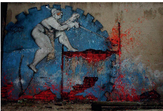
Fig. 3. Mona Tusz, Flywheel Setting , mural, Zinc Rolling Mill in Szopienice, 2011, photo by: M. Tusz.