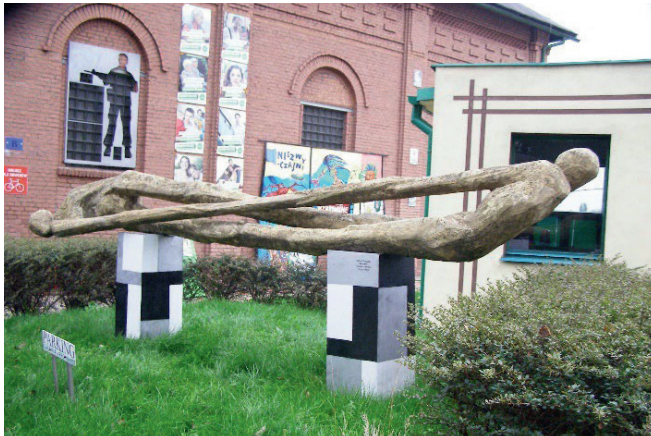
Fig. 4. Witold Pichurski, The Conjoined , wood sculpture, 185 x 500 cm, Wilson Shaft