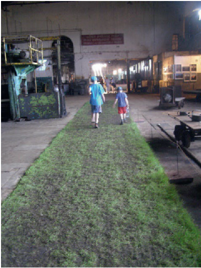
Fig. 1. Fragment of the installation Memory of Work... – at the Zinc Rolling Mill in Katowice-Szopienice, 2013, photo by: B. Stano.