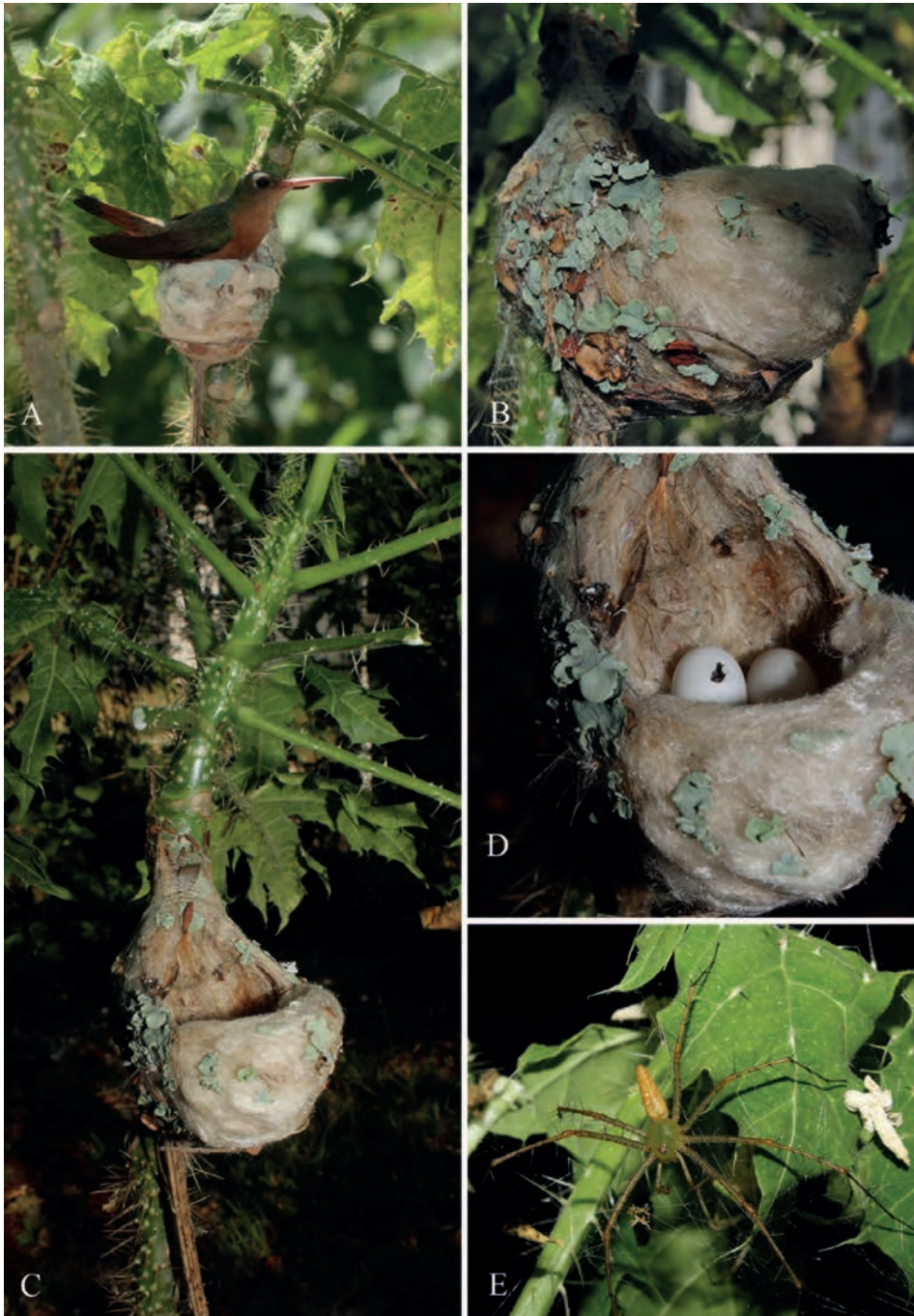
Fig. 2. Cinnamon hummingbird and host plant: A – Amazilia rutila De Lattre in nest; B – nest, C – nest in Cnidocolus aconitifolius (Mill.) I.M. Johnst.; D – nest eggs; E – Peucetia viridans Hentz in C. aconitifolius