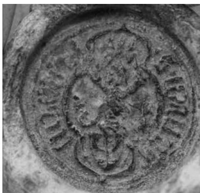
Il. 6. Seal no. 12