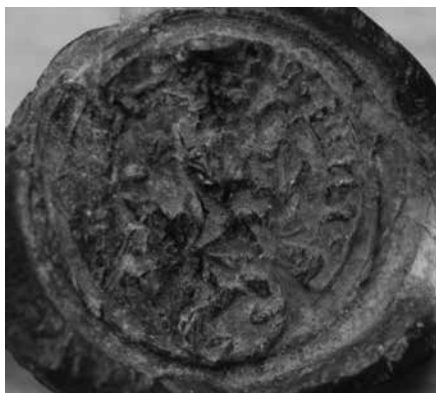
Il. 7. Seal no. 13

Note: Parchment: Palatini Leopold(iensis) . Piotr Odrowąż of Sprowa, Voivode of Lwów