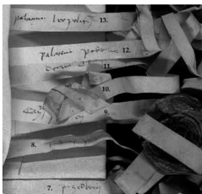
Il. 8. Seal-holder parchments