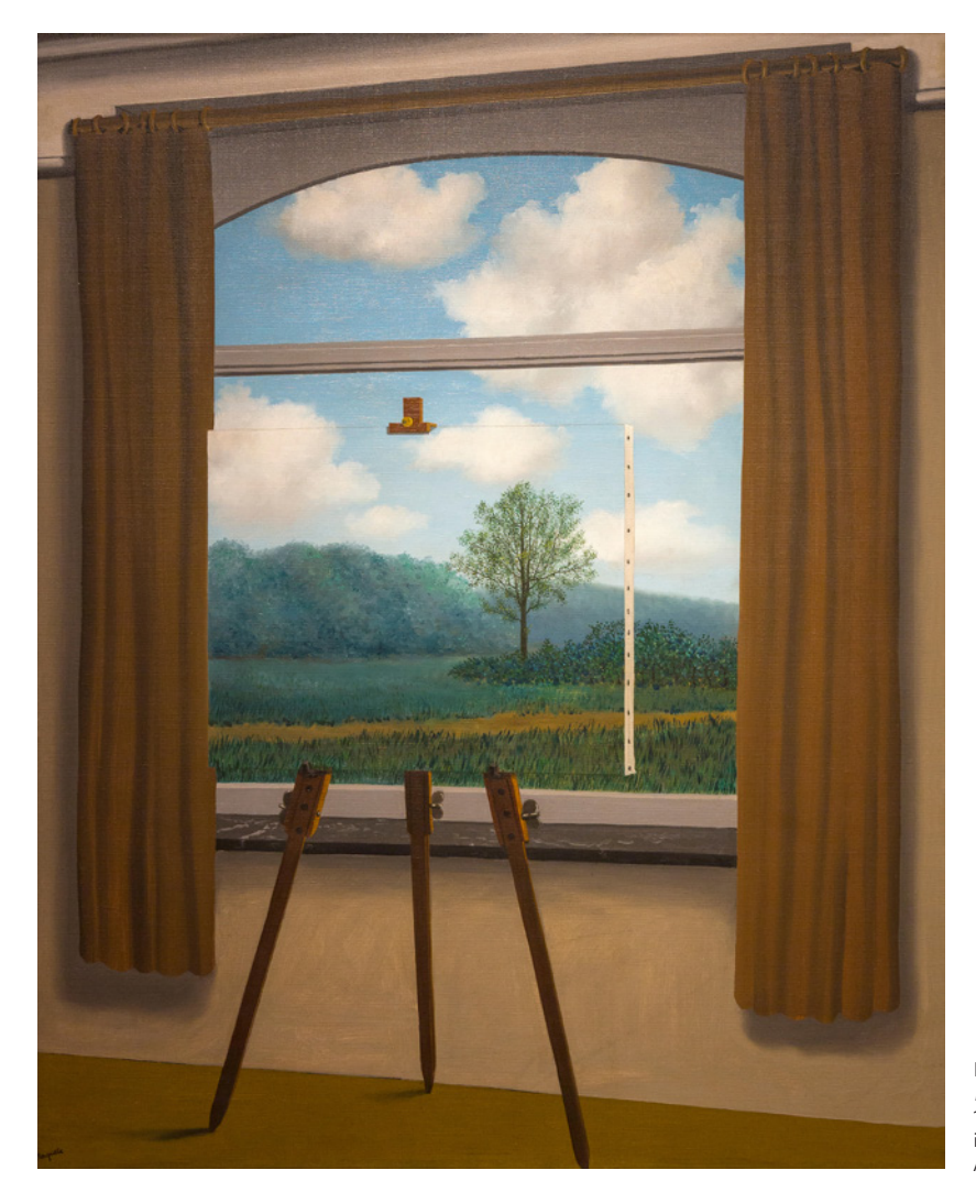
Rene Magritte, La Condition Humaine / The Human Condition, 1933, National Gallery of Art, Washington DC, USA.

oak, pine, cypress, palm, and oleander. Partridges and goldfinches feast on the fruit trees and rest on their branches. At first viewing, we are looking at a scene of hyper-fertility and abundance, at the idealized and unbridled play of nature (natura), free from human intervention. When we lower our gaze, however, the perimeter wall with a solitary birdcage perched suggestively upon it, and the garden path, the ambulatio, tell us otherwise. We are looking, in fact, at the imposition of culture (cultus) upon nature, at nature contained, an enclosed space, 'paradise' in the most literal sense of the word (paradeisos, from the Persian pairidaeza, pairi [around] + daeza/diz [brick]). Of course, what we are looking at is a garden. At their most basic level,