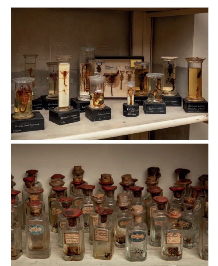
Fig. 7. Museum of Tropical Medicine. Zoology Collection. Dangerous Scorpions.