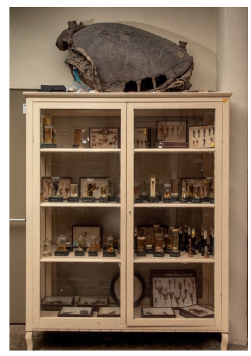
Fig. 1. Museum of Tropical Medicine. One of the old Museum windows in Villa Pentetorri.