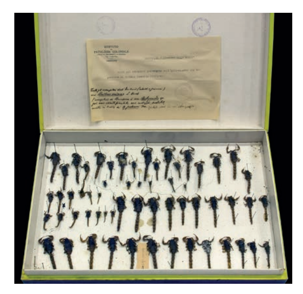
Fig. 5. Museum of Tropical Medicine. Zoology Collection. "Dangerous Scorpions from Eritrea, one from Bardera (Somalia)". Photo G. Roli

▼ Fig. 6. Museum of Tropical Medicine. Zoology Collection. Dangerous Scorpions. Photo G. Roli