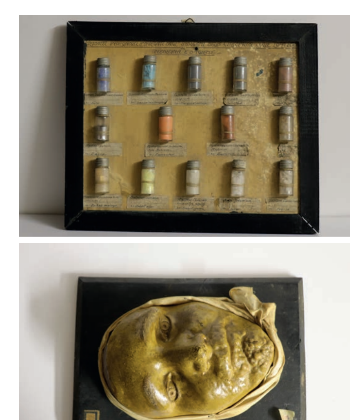
Fig. 9. Museum of Tropical Medicine. Indigenous Medicine Collection. Inorganic substances used by indigenous Cyrenaicans in medical and hygiene practices.