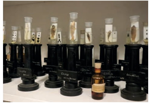
Fig. 3. Museum of Tropical Medicine. Zoology Collection. Vectors of parasites.