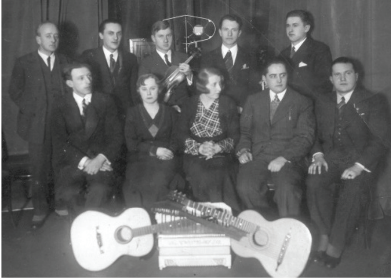
Illus. 7: The performers of the twenty-fifth Wesoła Lwowska Fala on 5 November 1933.