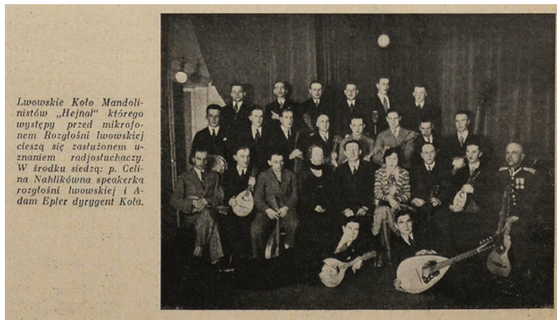
Illus. 3: The radio photo of 'Hejnał' from 1931.

The collaboration between 'Hejnał' and the Polish Radio Lviv took place practically from the beginning of the radio's activity. Polish Radio Lviv was officially launched on 15 January 1930 31 and already on 17 May 1931 the Radio magazine published a photo of the orchestra with the caption: "The Lviv Mandolin Society "Hejnał" whose performances in front of the microphone of the Radio Lviv enjoy the well-deserved recognition of radio listeners." 32