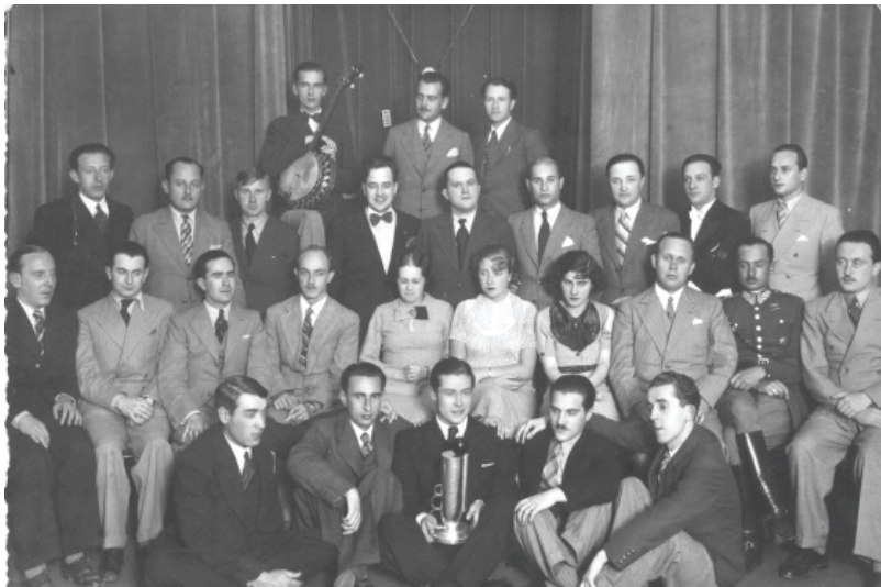
Illus. 8: The participants of the composition competition of Wesoła Lwowska Fala from 30 September 1934.

gmunt Schatz. 111 On the 21 October 1934, the first two compositions were performed before the radio programme Wesoła Lwowska Fala . 112