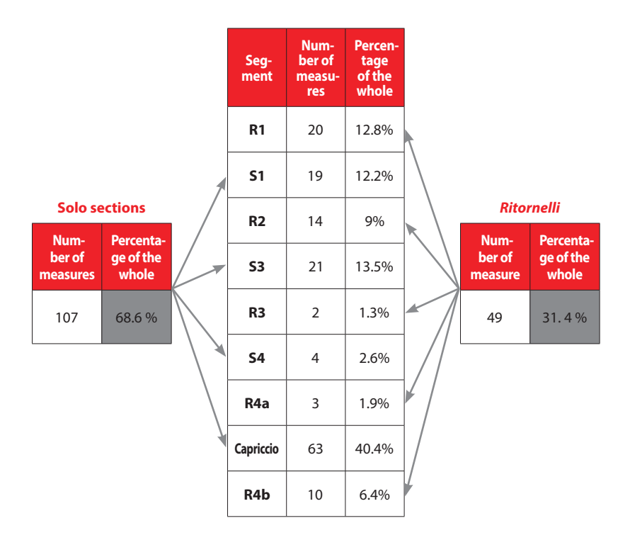
Table 2. Number of measures and the length ratios between the successive segments of Movement Two of Locatelli's Violin Concerto in G major (Op. 3 No. 9).

In Movement One, Locatelli presents four ritornelli , three solo segments and a Capriccio , that is, an extensive solo cadenza which comes before the last entry of the orchestra. Such a number of segments corresponds to the norms then set for violin concertos. Interestingly, the solo fragments constitute a large proportion of the music in this section, which proves the composer's focus on the solo part.