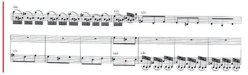
Ex. 17. mm. 107-113.

The solo episodes in this section are technically more demanding than the analogous passages in Movement One. Nevertheless, the range of technical problems presented in these episodes is narrower and includes (broadly conceived) passage playing, using the instrument's entire scale, left-hand dexterity, various kinds of articulation, such as staccato , as well as large interval leaps.