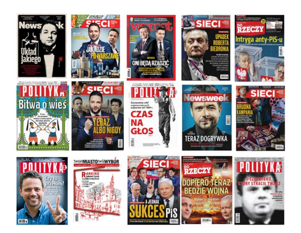
Figure 1. Selected covers of weekly magazines

Most often, the cover included the "face" of the election along with an expressive slogan announcing the main thesis, elaborated in the middle of the issue. For example: Jaki's Deal (Układ Jakiego), They Will Rule (Oni będą rządzić), The Fall of Robert Biedroń (Upadek Roberta