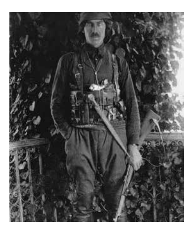
Figure 9. The Circassian commander of Nationalist irregulars, Pshevu Ethem Bey (Ethem the Circassian) (C. Kumuk, Düvel-i Muazzama'nın Kıskacında Kafkasya Dağlıları , Istanbul, 2022, p. 614)