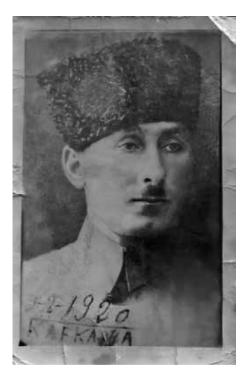
Figure 12. The Ottoman field commander with Abkhazian origin Kapba Kazim Kap, The Caucasus, 1920 (C. Kumuk, Düvel-i Muazzama'nın Kıskacında Kafkasya Dağlıları , Istanbul, 2022, p. 500)