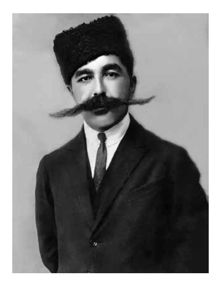
Figure 14. The second president of The Republic of the Union of The North Caucasian Mountaineers Pshemakho Kotse in a Turkish Migration, Istanbul, 1920s (https://www.wiki-wand.com/ru/ru/Koцeb,_Пшемахо_Тамашевич)