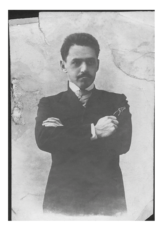
فرقه می PARTI REPUBLICAIN FEUER ALISTE DU CAUCASE DU NORD

Figure 1. The Stamp of the Republican Federalist Party of North Caucasus