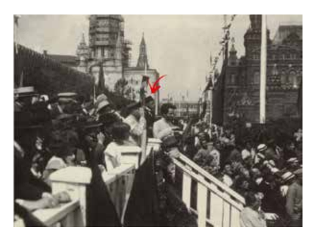
Figure 15. II Congress of the Comintern demonstration on Red Square. In the center: The Foreign Minister of Ankara Government, Ethnic Ossetian, Kındukh Bekir Sami-bey. Moscow, 27 July 1920

Figure 14. The second president of The Republic of the Union of The North Caucasian Mountaineers Pshemakho Kotse in a Turkish Migration, Istanbul, 1920s (https://www.wiki-wand.com/ru/ru/Koцeb,_Пшемахо_Тамашевич)