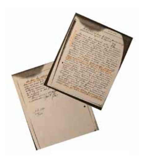
Figure 19. Sultan Klych Guirey's Resignation Letter After Lazar Bicherakhov's Appointment by Said Shamil as the Leader of the European Structure of NPGK

Fig. 18 The Bilingual (Turkish-Russian) Publications of thePopular Party of the Caucasian Highlanders (1934-1939)