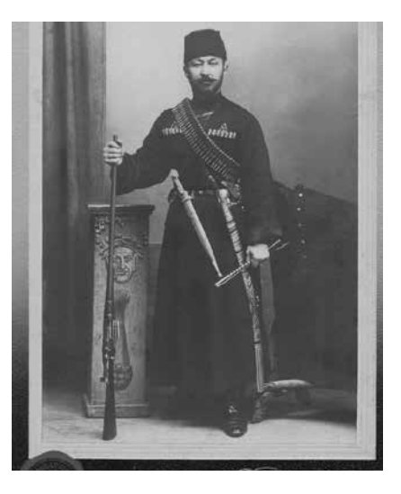
Figure 10. The Circassian loyalist Ottoman Commander, Anchok Akhmed Anzavur