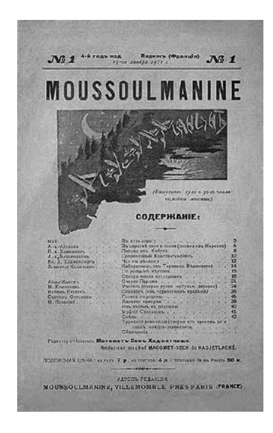
Figure 4. "Journal Mousoulmanine" Paris 1911, No 1