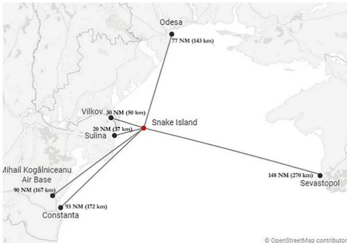
Figure 2. Approximate distance of Snake Island from selected significant Black Sea locations shown in nautical miles and kilometers