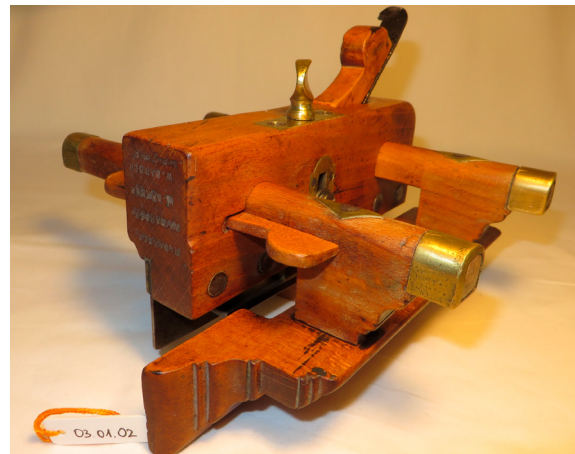
13. Adjustable plough plane to make grooves along planks for tongue-and-groove connection, England, turn of the 20 th c.; unidentified manufacturer, London, hornbeam wood, brass fittings, massive ornamentally beveled horizontal fence combined with spacer arms and stabilized with wedges; steel vertical fence (grooving depth) adjusted with a screw with a butterfly; illegible trademark and ownership mark stamped on the stock front