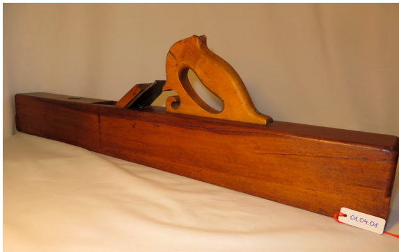
14. Fore plane for working long surfaces, Sweden, early 20 th century; craft product, pear tree wood (?) and hornbeam wood; double irons manufactured by Erik Anton Berg, Eskilstuna, Sweden; slight wear and tear; historicizing ornamentally incised and closed handle leaning to the front, beveled edges