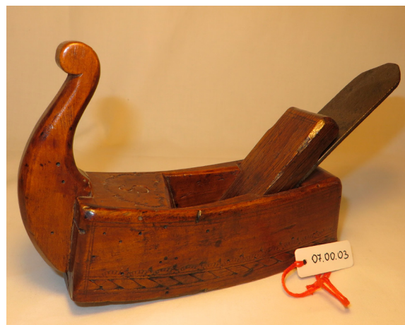
3. Cooper's circular plane for working the interior barrel surfaces, Poland, Lower Silesia, 2 nd half of the 18 th c. (?); craft product, pear tree wood (?), beech wood wedge; iron: blacksmith's product; 'S' signature on the body; the 'nose' in the shape of a simplified volute, front stock ledge missing, cut out and die cut ornamentation, dicing, signature, smith's-made iron, also wood variety make up the historic value of the tool

Urban museums, if interested in guild output at all, cherish interest predominantly in artistic crafts, e.g. the Museum of Artistic and Precise Crafts in Warsaw; at the National Museum in Gdansk, being a major centre of historic cabinetmaking, only the products, namely furniture pieces, are displayed, while the methods: workshops and tools are absent. 9 Neither have tools been on display nor plans have been made for tool display at the still not reopened National Museum of Technology in Warsaw. At urban historical and ethnographic museums woodworking tools are rare exhibits. The exception proving the rule can be found in Cracow and its Seweryn Udziela Museum of Ethnography; collecting traditional woodworking tools, since 2015 it has been conducting research into wood- and metalworking workshops in Lesser Poland. 10 At open-air museums and regional ones what can be found are usually interiors of carpenter's workshops with few and not precisely described tools from the 19 th –20 th centuries. Among the more interesting collections mention should be made of the following: Craft Museum in Krosno, Museum of Carpentry and Biskupizna in Krobia (Greater Poland), mounted in the