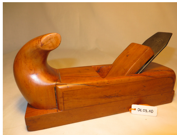
9. German-style smoothing plane, dubbed bismarck, used for the final touch on wooden surface, Sweden, 1st half of the 20 th c.; craft product, hornbeam wood; double irons manufactured by Erik Anton Berg, Eskilstuna, Sweden; meticulous manual working, massive ergonomic handle, dicing

1982–2020, although the conditions for searching in the pandemic are quite restricted. The oldest of my pieces date back, as far as I can assume, to the late 18 th century, the most recent ones come from the 1970s. The collection thus covers the period of almost 200 years of deep transformations shaping the contemporary reality, meaning that in the