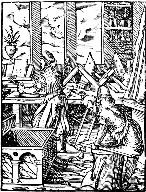
1. Joiner's workshop from the mid-16 th century: manual woodworking with a wooden frame saw and a German-type plane with a 'nose', namely a hand-grip for the left hand; also visible: joiner's bench: woodworking bench with bench stops and tools: long planes, so-called fore planes, carpenter's squares, a compass, marking gauges, chisels, gimlets, and a stump and axe for carpentry; material: unedged timber and planks; the final product: a chest of frame-and-panel structure with wooden panels featuring an intricate ring pattern. Wood engraving by Jost Amman, Der Schreiner , in: Stände und Handwerker , Frankfurt am Main 1568

Assuming after Thorstein Veblen and his already classical Theory of the Leisure Class , 2 the phenomenon of collecting (in its colloquial meaning of the term) to be a para-scientific or (and) para-artistic activity, the collectors of apparatuses and production tools, as distinct from connoisseurs amassing works of art, used to have in the past and may still have problems with their prestige or PR. All because their passion may not be perceived as an activity consolidating the position of the social elites from Veblen's realm of conspicuous leisure and consumption , yet as a testimony to having a connection or even affirmation of labour degrading one's image, being the domain of social classes traditionally regarded as inferior. 3