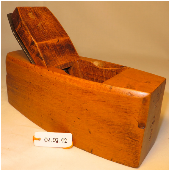
10. 'Coffin-style' smoothing plane used for final woodworking on short surfaces, England, early 20 th c.; factory product manufactured by William Green-slade and Co, Bristol, hornbeam wood; double irons by unidentified manufacturer; owner's mark on the front, beveled edges