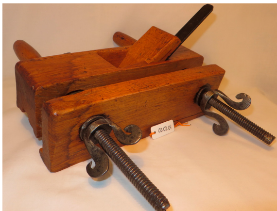
8. Adjustable tongue plane used for working tongue-and-groove connections (e.g. floor planks), Poland, Podlasie Region, 2 nd half of the 19 th c. (?); craft joiner's and smith's product, hornbeam wood; horizontal fence with a rare steel adjustment mechanism on screws piercing the stock and the horizontal fence, with butterfly nuts on one side, and wood-covered handles on the other; the tool could be used by two people facing each other; dubbed zweimanhobel in joiner's jargon