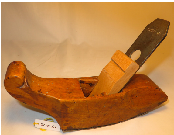
6. Dutch-style circular plane for planing concave surfaces, Poland, Pomerania, 1 st half of the 20 th c.; craft product, hornbeam wood, sole covered with sheet metal; adapted iron, replaced wedge; front handle resembling a reduced scroll; sides of the rear part of the body strongly beveled for the right hand; traces of the geometry of the wedge opening marked with a metal stylus