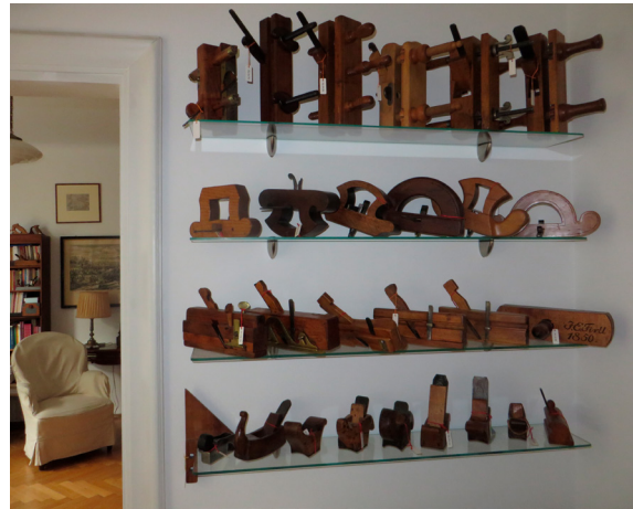
5. Fragment of the home display of woodworking tools

displayed in bookcases and on shelves in the flat where it competed with books for space.