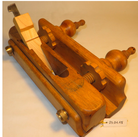
12. Adjustable plough plane used to make grooves in planks for tongue-and-groove connection, Austria, 1918–1945; factory product manufactured by Jo-hann Weiss und Sohn, Vienna, hornbeam wood, adapted iron, replaced wedge, 'continental' type; horizontal fence stabilized on wooden screws with rotund turned nuts and flat counter nuts, wooden groove-depth fence, adjustment on steel screws with brass nuts