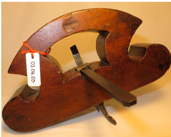
11. Grooving plane used for removing material from grooves to a given depth between two parallel incisions in tops (of e.g. chests of drawers), Germany (?), turn of the 20 th c.; factory product, unidentified manufacturer, pear tree wood (?); stock machine-cut with horizontal bandsaw; screw holding the iron with damaged steel butterfly nut; Polish craft product, adapted iron