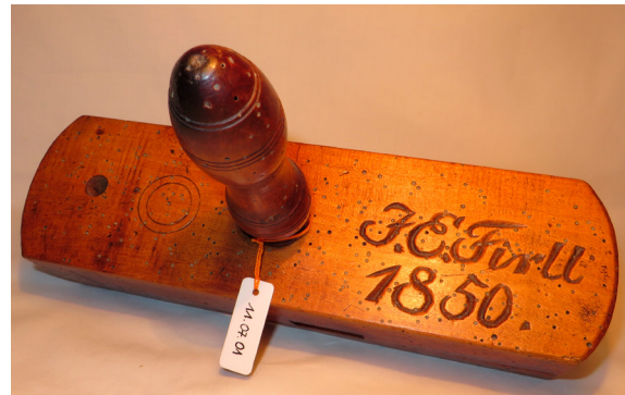
15. Die used for threading wooden screws, Poland. Wrocław, 1850; craft product, J.E. Firll; in the opening a model screw with a turned handle: tool used for making screws for vices on woodworker's benches and various handscrews as well as presses; steel screw taps were used to make the tapped hole, matching the die's diameter and thread pitch