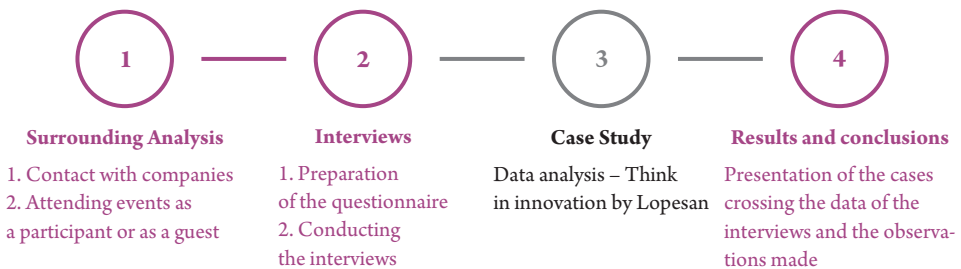
Fig. 1. Preliminary preparation