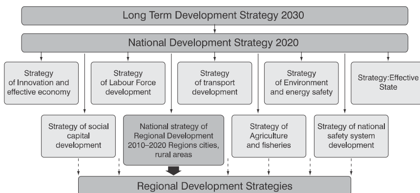
Graph 2. Relationships among strategic planning documents in Poland's development policy in 2013. Source: own study based on: materials from the Ministry of Regional Development.

Referring to the previous system, the documents were organized with a higher level of coordination, especially between the long-term planning and sectoral documents. This was intended to consolidate the actions under development policy and bring some synergy effect in regional and spatial dimensions. Strategic planning is very important for ensuring regional development. Rebuilding the whole strategic planning system was initiated by diagnosing dysfunctions of strategic planning. It resulted in systematizing valid documents by defining the ones which were not implemented and which were repeated or inconsistent with other ones.