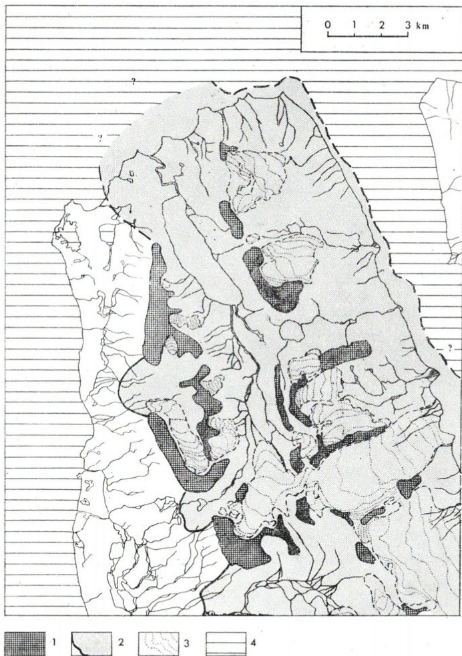
Fig. 2. Map of ancient glaciations in the north-western part of Nordenskiöld Land and their extents 1 — rocky nunatacs; 2 — ancient (maximum?) extent of the ice-cover; 3 — contemporary glaciers; 4 — surface waters.