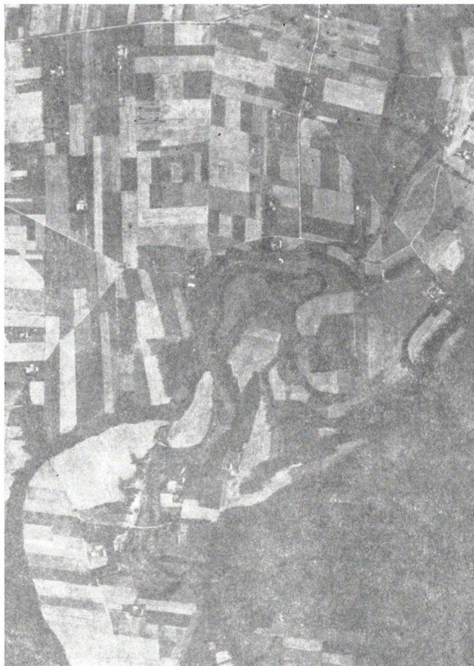
Fig. 2. Fragment of the Plock area of investigation in a 1:15000 panchromatic shot (PAN), August 1978.