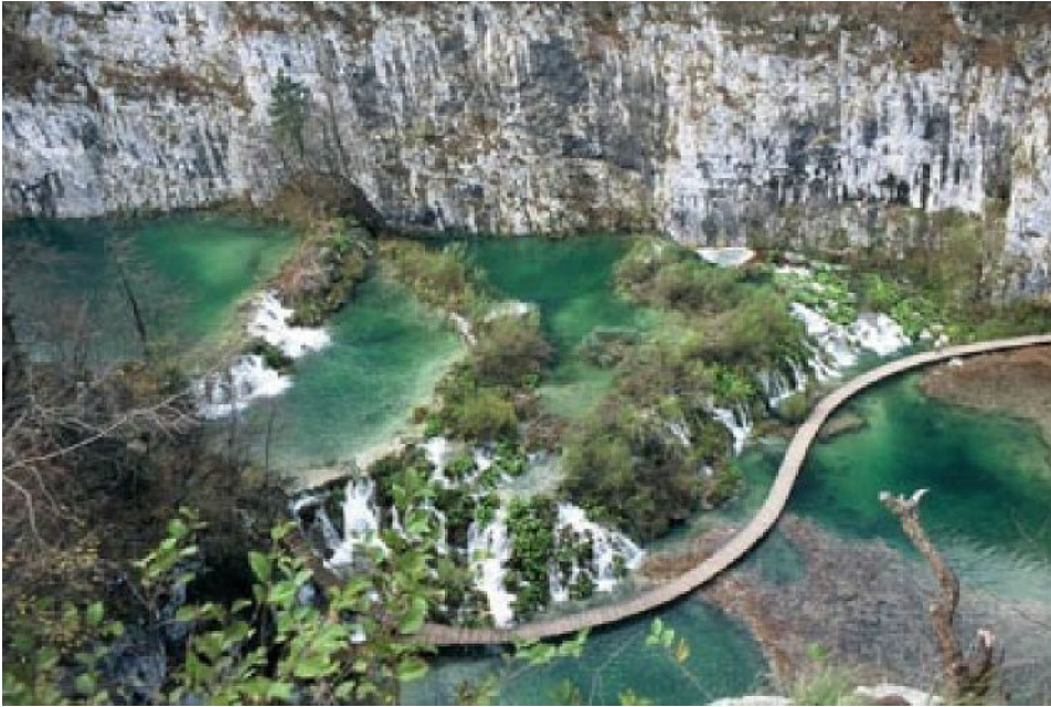
Fig. 2. An example of barriers separating reservoirs. On the left Lake Kaluđerovac, on the right Lake Novakovića Brod.

analysis of the geological map and field observations indicate that the barriers were formed on tectonic faults, which is related to the disturbance of the \text{CO}_2 equilibrium in such places, resulting from the sudden release of \text{CO}_2 from under rock layers lying above. Karst waters are saturated with calcium carbonate, which is precipitated from water and forms underwater barriers. Growing by a few millimetres each year, the barriers eventually emerge above the water surface where mosses start growing on them. The moss species occurring in the Plitvice Lakes are Cratoneuronum Commutatum and Bryum Pseudotriquetum (Pevalek, 1958). Bacteria living on the moss extract calcium carbonate dissolved in the water and include it in their structure; as a result, the moss petrifies and turns into rock. Rock created this way is called tufa (sedra). Such biogenic rocks are particularly characteristic for the Plitvice region, but rare elsewhere in the world. Petrified fragments of moss can be seen in the structure of the rocks. Tufa plays a great relief-forming role, since it causes the division of lakes into smaller reservoirs.