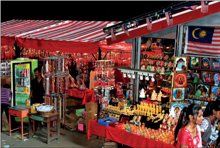
Photo 3. Small souvenir shop with devotional items inside the great cavern in Temple Cave (Gua Kulil)