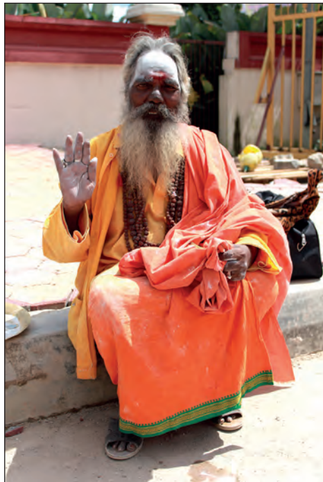
Photo 5. Sadhu – Hindu sage/ascetic blesses pilgrims, sprinkling their heads and foreheads with white ash