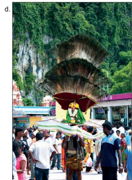
Photo 4. Kavadi may have various shapes, colours and sizes, which greatly depend on the sex and the age of a pilgrim