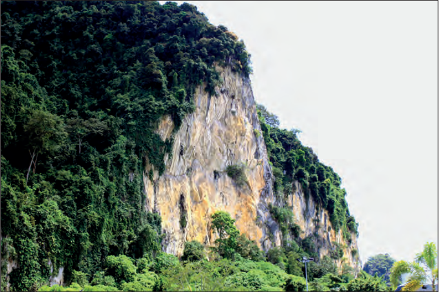
Photo 1. Vertical limestone rocks of Batu massif are used by amateurs of adventure tourism