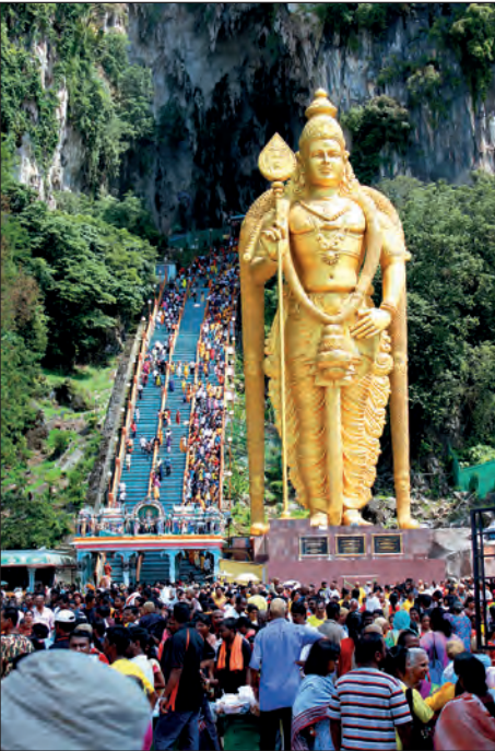
Photo 2. The world's tallest statue of Lord Skanda and steps for pilgrims leading to Temple Cave (Gua Kuil) and Dark Cave (Gua Gelap)