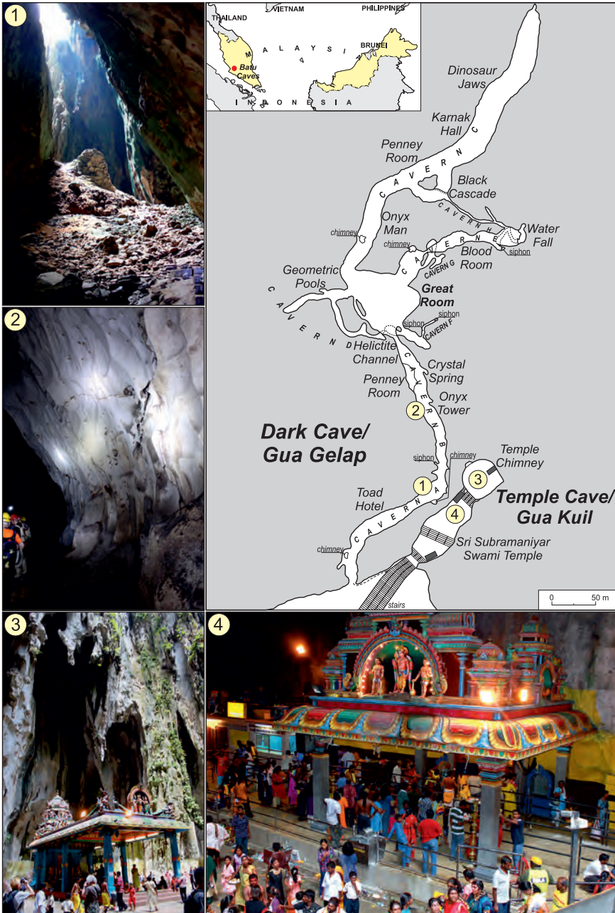
Fig. 2. Plan of Temple Cave (Gua Kuil) and Dark Cave (Gua Gelap): 1 – Karst shaft in corridor A in Dark Cave, 2 – Part of corridor B in Dark Cave, 3 – Karst shaft lighting Temple Cave, 4 – Sri Subramaniyar Swami temple inside Temple Cave