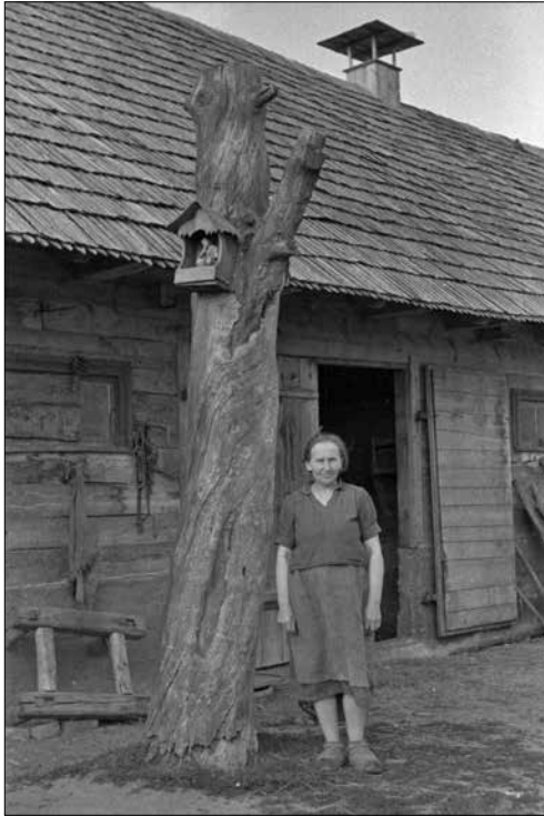
III. 1. Mažeikiai district, Viekišniai neighbourhood, Plūgai village, ŠAM Neg. 11360. Photo by St. Ivanauskas, 1942

majority of my earlier articles aimed at revealing the diversity of iconography, different functions and complex conception of the image of Christ in Distress within the Catholic Church tradition 2 .