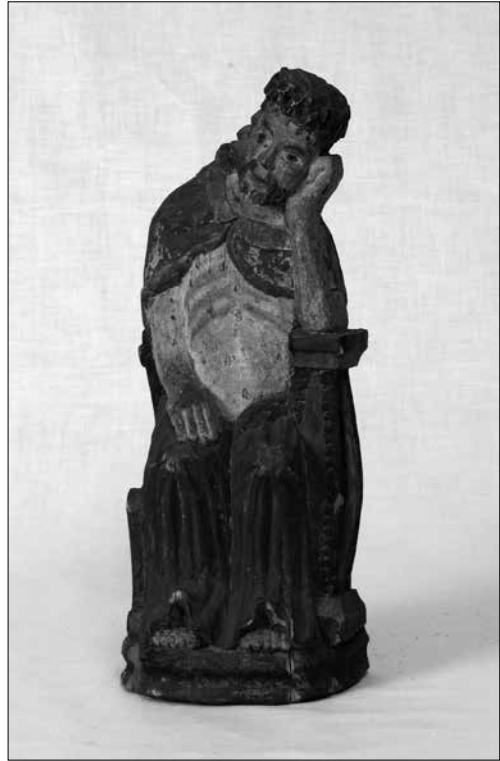
III. 4. Siautuliai village, Šilalė district, 1823. Wood, polychrome, H 300. ŠAM inv. No. D-LS 100.

tries; differs only the prevalence and popularity of one or another variation of this type in a particular area. However, it is not possible to distinguish any single iconographic type of Christ in Distress which would be typical of only one region and would not be found in another region. In general, my earlier investigations indicate that particular copies of prototype have spread in different regions of Europe and Latin America, and they have determined predominance of one or another variation of Christ in Distress representation in that territory. Perhaps, the terms used to describe Christ in Distress in the folk such as “smutkas”, “smūtkiuukas”, “smūtkelis” (one who is in distress) 29 , “mūkiukas” 30 (one who suffers) have been taken over from the Bernardines, who so named the image of pensive Christ. Christ in Distress is named as “Mr Jesus in distress” (in Polish – smutny Pan Jezus) in the chronicle of Vilnius Convent 31 . The names established in folk