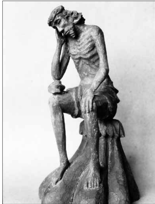
III. 6. Aco kavai village, Radviliškis district. 1770 (?). VDKM inv. No. BBN 8798. Photo by B. Buračas, 1930s

One Polish legend tells about the Saviour sitting under the cross, who looking at the Adam's skull is contemplating about human sins 54 . This is a rather late interpretation. In my opinion, the attribute of Adam's skull is related to the teaching of St. Paul.