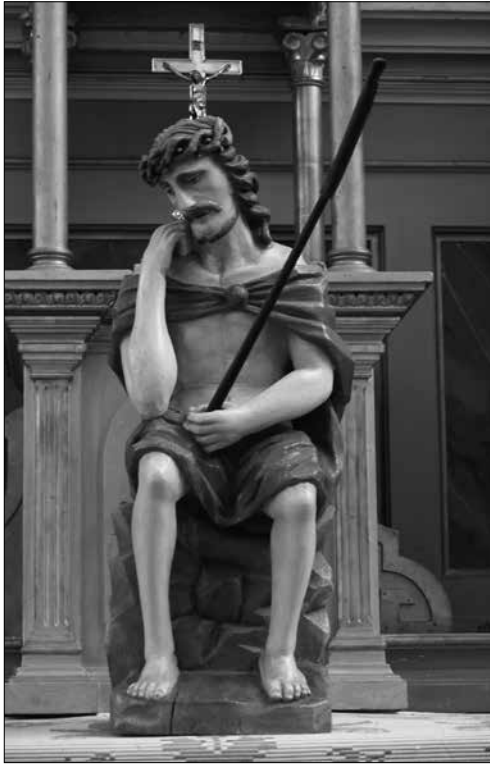
III. 2. Krakės St. Mathew Church (relocated from Krakės St. Katharina Church). 3th qr. of the 18th c. Wood, polychrome, H 73 cm.

urgy of Holy Week were performed in which he lamented the destruction of Jerusalem 16 . “Is it nothing to you, all ye that pass by? Behold, and see if there be any sorrow like unto my sorrow, which is done unto me <>.” (Lam. 1, 12) 17 . This fragment from the Book of Lamentations usually was interpreted not only as a prophecy of the Passion of Christ, but used also to express the passions.