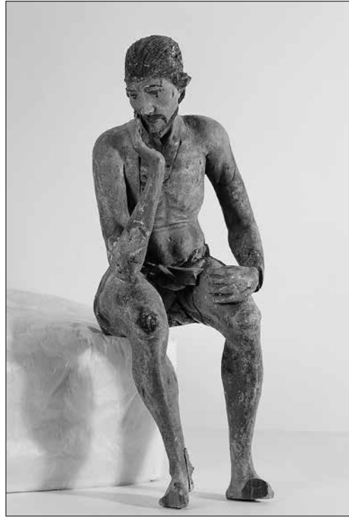
Ill. 3. Christ in Distress from Aleksandravėlė Church called as Jesus lamenting for Jerusalem, beginning of the 17th c. Wood, remains of polychrome, H 75 cm. VDKM inv. No. BM 47.

The sweetest Christ, as prophet Jeremiah once, seated on a stone which was given to him instead of the throne, started to sing sorrowful laments. but the daughter of my people has become cruel, like the ostriches in the wilderness 22 .