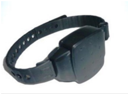
Figure 2 [Electronic Bracelet] 6

All technical means are owned by the state. Ministry of Justice of the Slovak Republic administrates them.