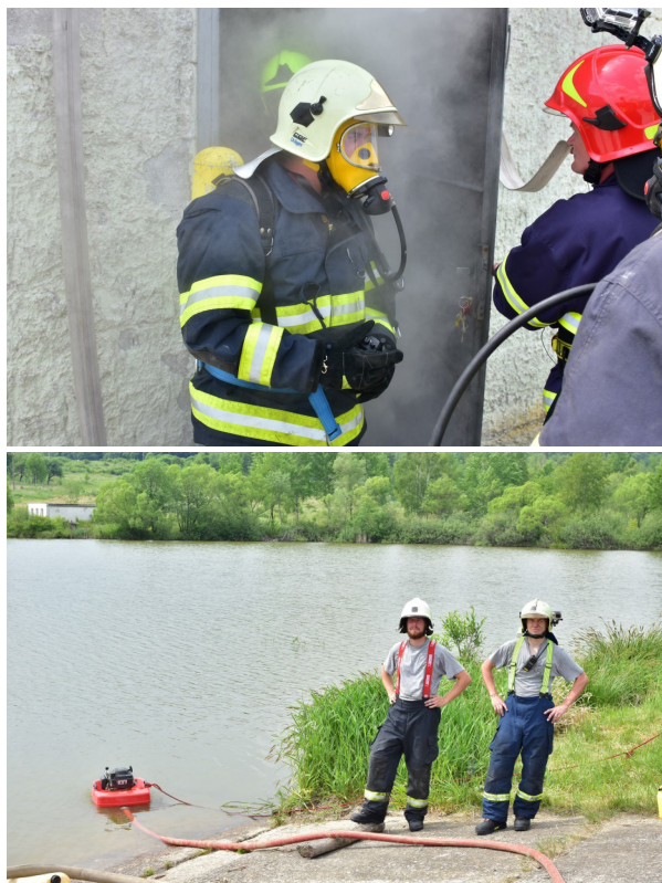
FIGURE 2 FIREMAN HAS LEFT THE COCOON OF THE NECK THEREFORE NOT PROTECTED. FIREFIGHTERS AT RIGHT HAS DEPLOYED EMERGENCY CLOTHING

The most common causes of accidents wrong use of personal protection equipment (PPE) can be classified wrong size emergency clothing or gloves, unstretched premium loops through the thumb, which prevents