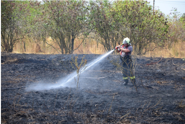
FIGURE 3 LEFT IN USE FIREFIGHTER RESPONSE COAT OR GLOVES. FIREFIGHTERS DO NOT USE THE RIGHT-CONTAINED BREATHING APPARATUS FOR FIRE FIGHTING.

The most serious violation of the principles of safety and health at work is not using the appropriate PPE. Due to non-use of PPE injuries to firefighters and endanger the whole unit during intervention activities. Suddenly, from the current intervention has become an event during which firefighters must save his own member use.