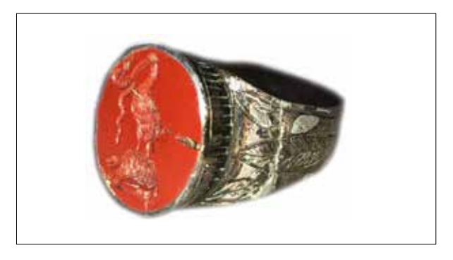
Fig. 9. Intaglio, an ibis (Thoth) with a snake stands on a tortoise (Hermes) (red jasper), 13 x 6 mm, set in a modern silver ring. Private collection.

or simply hybrid/combination gems.<sup>48</sup> This was because red jasper was believed to bestow strength, fortitude and courage on its carrier and was valued as a natural remedy to calm turbulent blood, slow down an accelerated heart rate, and curb excessive desires. It was thought to be efficacious in any bleeding and to facilitate childbirth.<sup>49</sup>