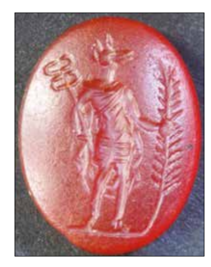
Fig. 1. Intaglio, Hermanubis with the kerykeion and a palm branch (carnelian), 16 x 12 x 4 mm. The British Museum, London, inv. no. G 420 (EA 56420).

Glyptic art, alongside other media, provides evidence for Hermes's syncretisation with Egyptian deities such as Anubis, but also Thoth. In Munich, there is a haematite intaglio featuring Hermes and Anubis standing next to each other. The combination of Hermes and Anubis, also known as Hermanubis, frequently appears on gems and is illustrated in a standardised form, e.g. as a jackalheaded anthropomorphic figure dressed as a Greek and holding a kerykeion (Fig. 1). However, in Kassel there is an unparalleled magical gem cut in haematite that shows Mercury, Anubis and an ibis together. Since the ibis was a sacred bird of Thoth, the gem should be interpreted as