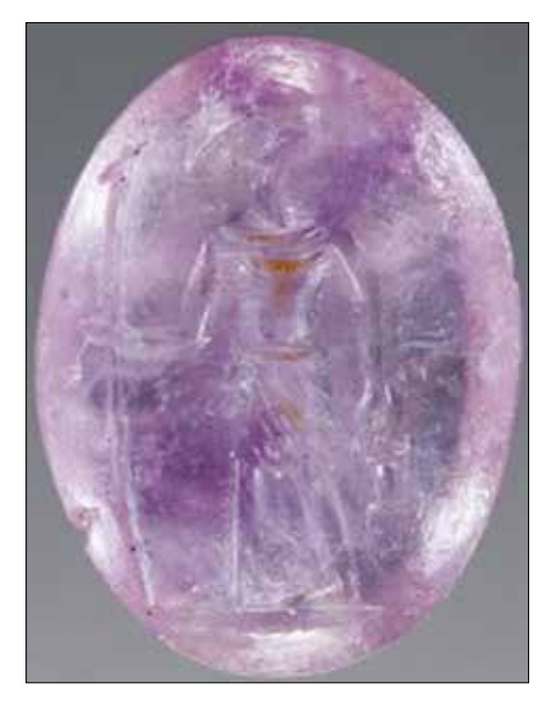
Fig. 4. Intaglio, ibis-headed Thoth (amethyst), 14 x 10 x 5 mm. The Jean Paul Getty Museum, Malibu, inv. no. 83.AN.437.55.

The ibis was sacred to and associated with Thoth because it represented the Nilotic revival and the cycle of life, as well as destiny.<sup>28</sup> Thoth was often represented on magical gems in the form of an ibis-headed human body, e.g. on the amethyst from Malibu, California (Fig. 4).<sup>29</sup> As a sacred animal, a dead ibis would be embalmed and put inside the hollow body of its wooden representation. Alternatively, the mummified remains were placed in pottery jars and deposited in vast underground galleries. Hundreds of thousands of such burials have been discovered at Sakkara, near Memphis, the ancient capital of Egypt.<sup>30</sup>