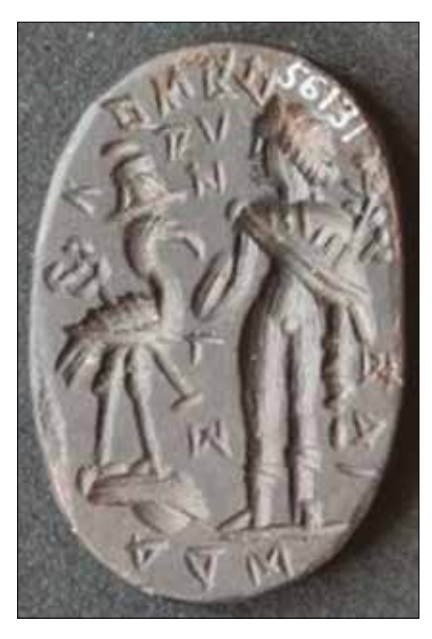
Fig. 3. Intaglio, Hermes and ibis (Thoth), inscribed (haematite), 22 x 9 x 2 mm. The British Museum, London, inv. no. OA.9620.