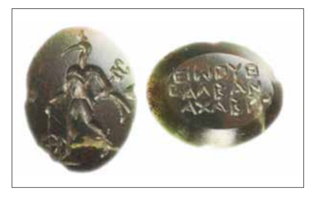
Fig. 2. Intaglio, Hermes-Thoth with a wheel and the caduceus, inscribed (green jasper-bloodstone), 15 x 12 x 2 mm. The Skoluda collection, Hamburg.

case of the touchstone intaglio which also features the figure of Apollo-Mithra and a red jasper engraved with Apollo on the other side, both in Paris.<sup>23</sup> Another important example is a haematite intaglio in London, where ibis-headed Hermes is sitting on a throne, holding the kerykeion while a solar deity is standing in front of him.<sup>24</sup> This setting may be explained by Thoth's original connections with primordial myths of creation and renewal of life to which solar deities were also attached.<sup>25</sup>