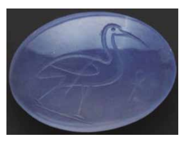
Fig. 5. Intaglio, an ibis with the ankh sign (chalcedony), 21 x 20 x 6 mm. The National Museum, Kraków, inv. no. MNK-Ew-IV-zł-119.

As reported by both Bonner and Michel, a very popular type of magical amulets would depict an ibis tied to an altar with three flowers or other plants. On Palestinian, and possibly Christian, amulets it is tied to a structure that lacks the plants at the top and instead it is usually attacking a serpent which symbolises Thoth's combat against evil. 35 An analysis of the inscriptions that accompany many of such pieces allows to conclude that those gems were particularly effective against indigestion and were also helpful in healing fevers (Fig. 7).36 The ibis was believed to be free of all diseases and was thought to be an antidote to poison or polluted water.<sup>37</sup> Thus, its healing powers combined with the properties of the stones which it was engraved upon (mainly green and black jasper, dark grey-green steatite, and dark brown limonite) significantly increased the effectiveness of this sort of amulets.<sup>38</sup> Yet, as Henig observes, there was a connection between Thoth, represented as the ibis, and Isis and this connection referred to the cult of regeneration.<sup>39</sup>