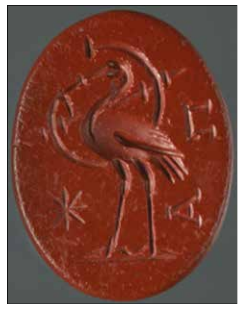
Fig. 6. Intaglio, an ibis blowing a trumpet ( lituus ), a star in the field, inscribed (red jasper), 12 x 9 x 3 mm. The National Museum, Kraków, inv. no. MNK-Ew-IV-zł-1827.

All of the types of amulets discussed above lack direct references to Hermes; however, it is worth pointing out that according to some magical papyri, Aesclepius was regarded as a disciple of Hermes-Thoth.<sup>40</sup> In light of the above, could these amulets, which clearly address