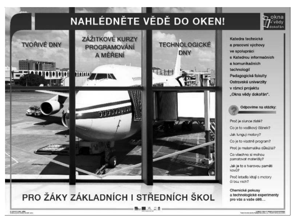
Fig. 1. Educational poster advertising the project

It was necessary to set main technological topics. We decided that the educational clips must cover topics of technological innovations, modern technologies, physical principles, technology development and also a medial presentation of the project and social cultural aspects of modern technologies. For effective education, there is necessary to enable an integration of knowledge from various subjects within each topic. The demonstration of some posters is illustrated in the Fig. 1 and 2.