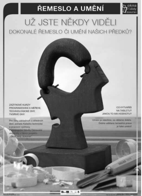
Fig 5. Social cultural impact of IT