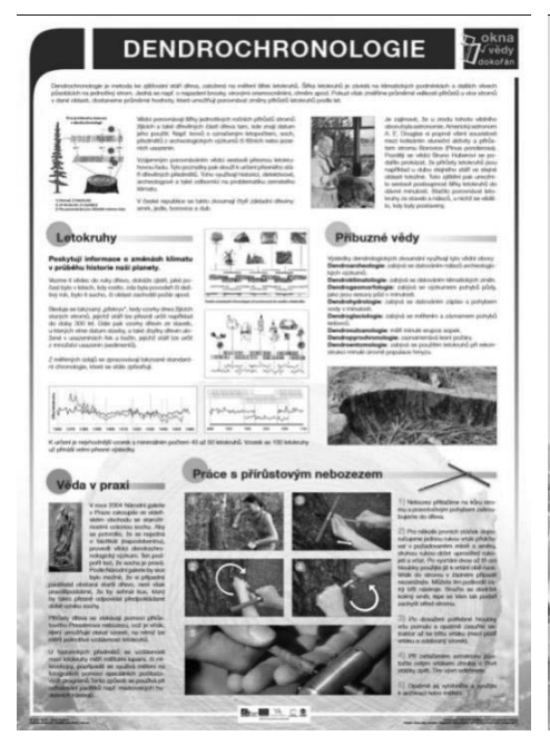
Fig. 4. Dendrochronology