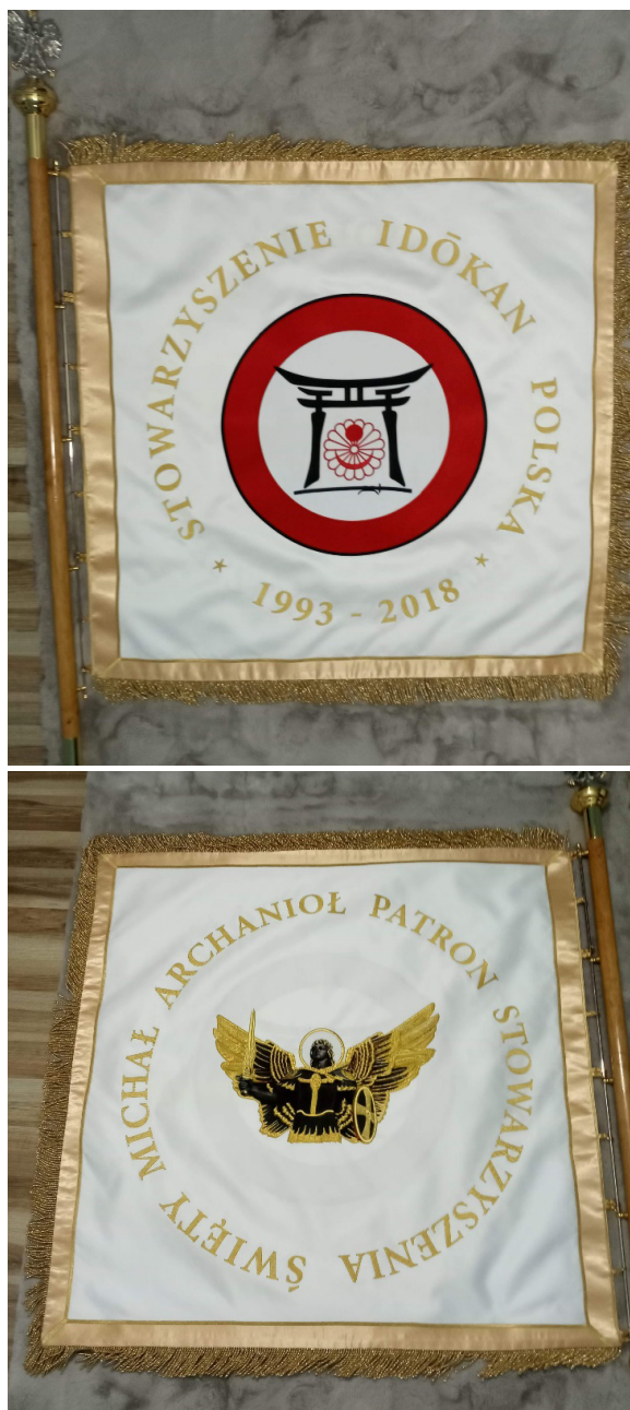
Photos 1-2. IPA banner, obverse and reverse, Nov. 2020 [courtesy of D. Ziobro & IPA].

It is significant that Bishop Kazimierz Gorny [2009] formally granted permission for the IPA to accept its patron saint – St. Michael the Archangel. Therefore, the IPA awarded this bishop with the Medal of the 20th Anniversary [Ciesla 2013]. The banner, the design of which was selected in a competition, shows the IPA emblem (obverse) and the figure of St. Michael the Archangel (reverse), modeled on the monument in Kiev (Photos 1-2). It was funded for the 25th anniversary of the IPA. It was escorted by hussars and was demonstrated during the IMACSSS Congress in Rzeszów in October 2018. At that time, this banner was consecrated in accordance with the Catholic and knightly ceremonies.