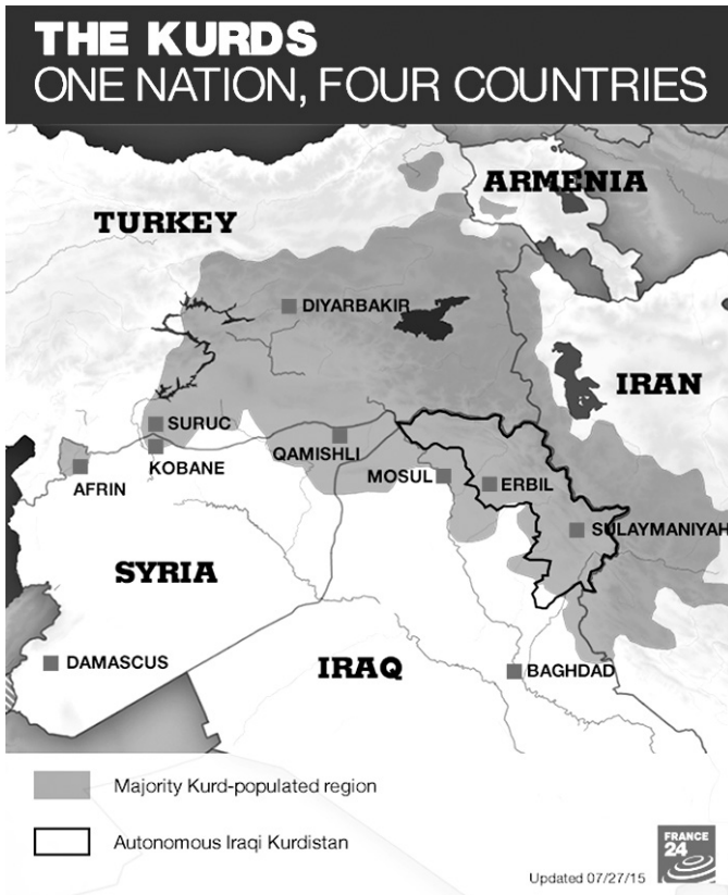
Chart 1. Kurdish geopolitics in the Middle East

is located in Turkey, amounting to around 14.7 million (18% of the Turkish population). Besides, Kurds also inhabit the following countries: Iraq – 5.5 million (17.5% of the Iraqi population), Iran – 8.1 million (10% of the Iranian population) and Syria – 1.7 million (9.7% of the Syrian population) (BBC, 2017). A large number of Kurds also lives in Armenia – 1 million – and Afghanistan – around 200 thousand. There is also the Kurdish diaspora settled outside this area (around 7 million). In particular, 2 million Kurds live in Europe, for instance in Germany or Sweden (Fuad, 2001, p. 5). The Kurdish diaspora with its increasing impact may play a crucial role in spreading the securitised Kurdish ambitions and national claims, which at the moment are treated as existential reference objects by the international public opinion. For instance, several times, waves of protests organised by Kurds have swept through many European cities, for example in Germany, Belgium or France (the impact and role of the Kurdish Institute of Paris).