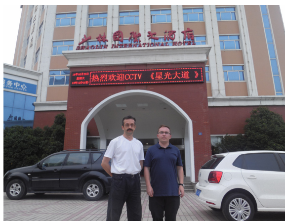
Photo 12. Shaolin International Hotel in Dengfeng.