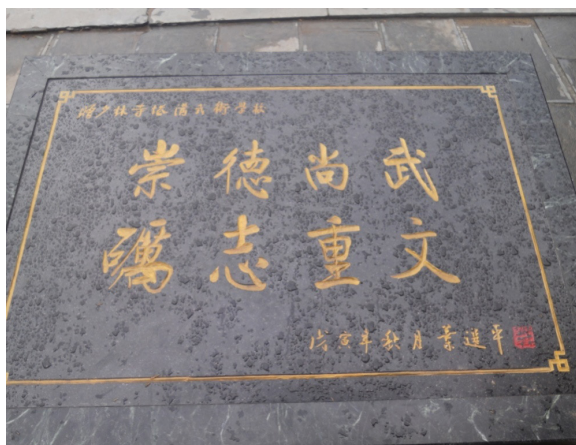
Photo 10. Motto: “Knowledge for practice kung-fu , and the practice – for knowledge” – a marble plaque in Shaolin.

The travellers also visited a Buddhist temple Fawang. It is located at a distance of only three kilometres from Shaolin. It is slightly older, and also is associated with