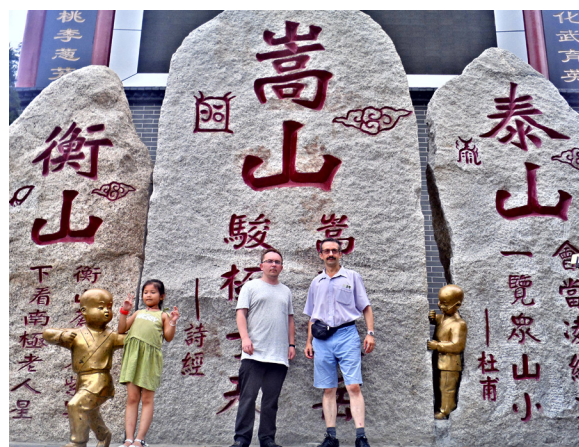
Photo 1. The authors in front of the biggest kung-fu academy in China: the Shaolin Temple Tagou Martial Arts School (or Shaolin Tagou Wushu School)

Shaolin is the centre of traditional Chinese medicine (acupuncture, qigong , herbal medicine). Above all, however, it is a historically significant centre of learning