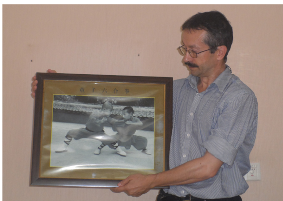
Photo 15. A picture with young Shaolin kung-fu athletes