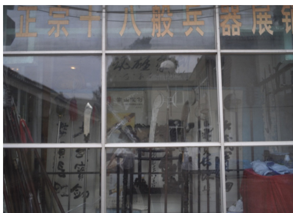
Photo 9. Traditional wushu weapons can be bought here

The authors visited the temple grounds and the “forest of pagodas” – the tombs of monks. How much is