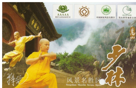
Photo 3. Admission ticket.