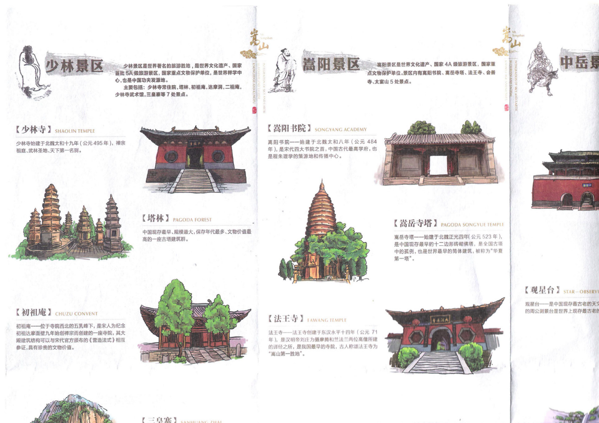
Fig. 1. The main monuments of Dengfeng area [Dengfeng Municipal Tourism Administration 2016].

was inferred from the Shaolin Temple, but this applies not only to Chinese martial arts. The origins of Shaolin can be seen in karate schools from Okinawa and Japan, Shorinji kenpo and a variety of Korean martial arts. So Shaolin became a legendary place. Numerous films in the “martial arts” genre (as “Shaolin Temple”, 1982) and productions from Hong Kong, and television programmes (such as US series Kung-Fu starring David Carradine, 1972-1975), created a modern myth of the monastery [cf. Cynarski, Slopecki 2016].