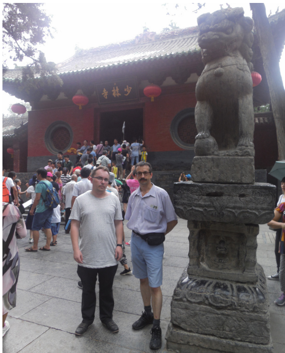
Photo 14. Next to the gateway to the Shaolin Temple.