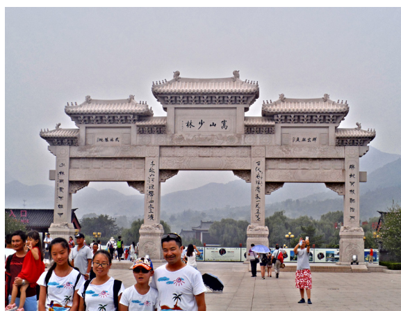
Photo 13. Tourists in area of the Shaolin centre, 2016.