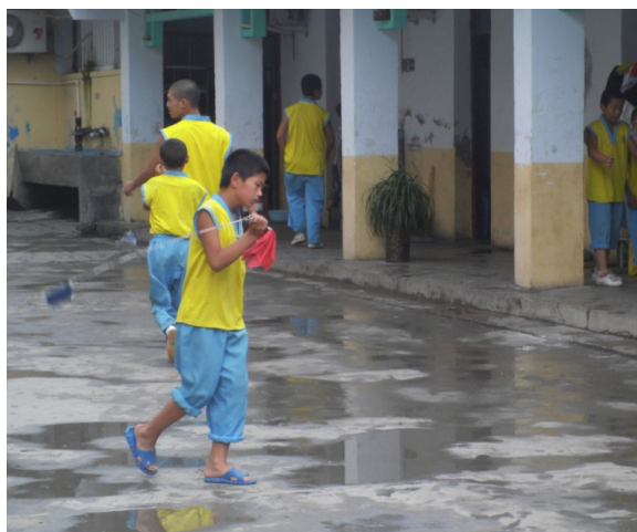
Photo 6. Students practise in a wushu school dormitory. Shaolin 2016.

Shaolin monks did not create fighting techniques, but they have refined and added to their practice a deeper meaning [ cf. Henning 1999; Acevedo, Gutierrez, Mei Cheung 2010]. In a similar way Taoist schools and school based on the principles of Confucianism have been developed. The tradition of many varieties of wushu / kung-fu