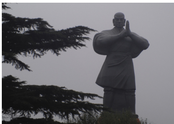
Photo 17. Shaolin monk on the statue.

And numismatic curiosity – all notes bear the image of Mao Zedong (Mao Tse-Tung). So every juan is the reminiscent of the great leader of the Chinese nation.