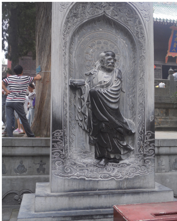
Photo 16. Patriarch Bodhidharma - between temples of Shaolin centre.