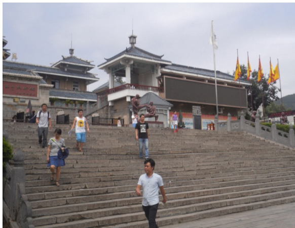
Photo 5. Place of wushu shows

The monastery was once inhabited by several thousand monks, today there are only a few left. The reminder of the old days, for example, are the holes in the bark of ginkgo biloba trees, which are the result of fingers strokes. The leaves of this tree are used to prepare medicinal tea. Monks still have it just like in the old days. They have it only twice a day for breakfast and lunch. They follow a vegetarian diet, no alcohol and no hot spices.