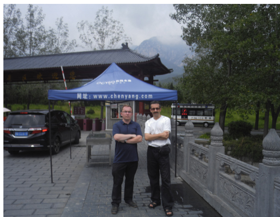
Photo 11. Near the Fawang temple. Summer 2016.

Many VIPs from the world of politics and from important institutions come here as well. Before August 20, 2016 the site was visited by Vladimir Putin, a highly controversial person, however certainly passionate about martial arts. In December 2015 the Indian Foreign Minister was here, so were many delegations of Japanese organization Shorinji kenpo , various wushu , karate associations e.g. an international association IMACSSS (the International Martial Arts and Combat Sports Scientific Society).