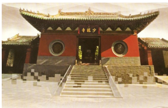
Photo 2. Gateway to the Shaolin Temple.