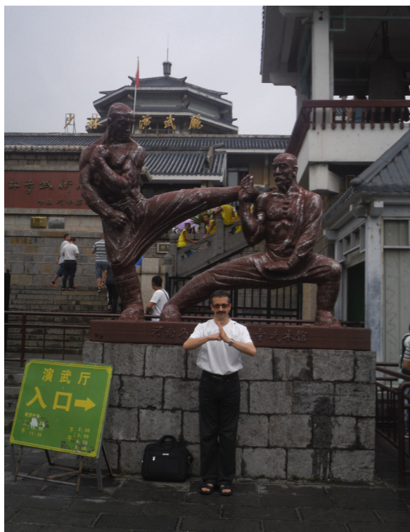
Photo 18. Greeting with the Ming gesture.