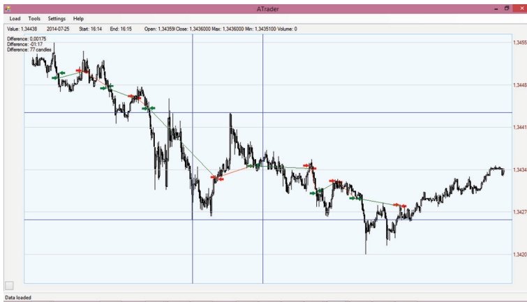
Figure 3. Main panel of a-Trader