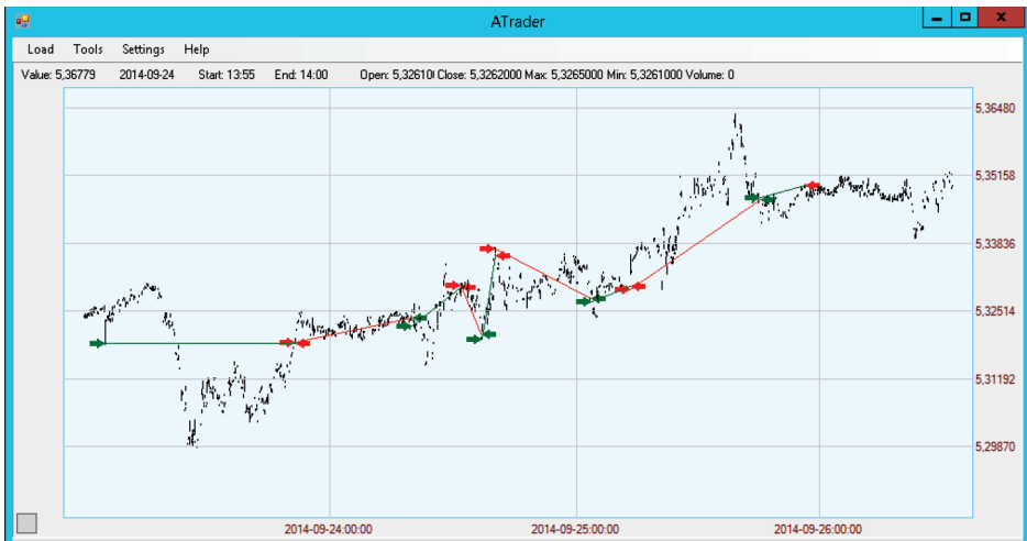
Figure 6. The example of strategy visualization