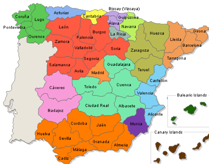
Figure 1. Map of Spanish provinces

We selected the childcare activities from the list that mirrors the list published in EUROSTAT's 2008 guidelines (see Table 2), so our final database is composed of nearly 20,000 observations corresponding to the time devoted by mothers and fathers to 5 childcare activities in 1,878 households.