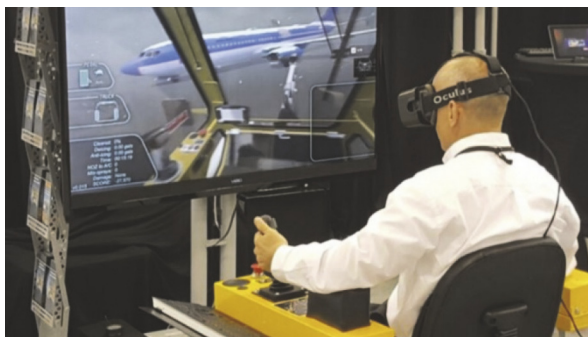
Picture 6. Aircraft de-icing operator training simulator

Source: http://forgefx.com/simulation-projects/aircraft-ground-support/deicing-training-simulator/ , [accessed: 14.09.2017 r.].