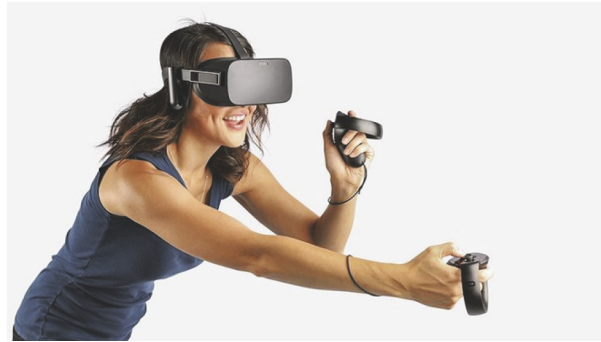
Picture 4. Gogle Oculus Rift

Source: http://www.gry-online.pl/Galeria/Html/Wiadomosci/197901994.jpg [ accessed: 20.09.2017 r.].