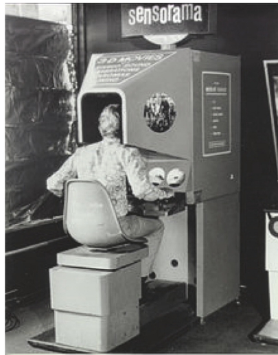
Picture 2. Sensorama