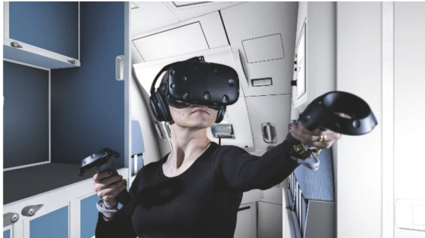
Picture 5. Training for personnel using a VR simulator

Source: http://www.adsadvance.co.uk/media/images/2017/EDM%27s%20VR%20Door%20Trainer.jpg , [accessed: 13.09.2017 r.].