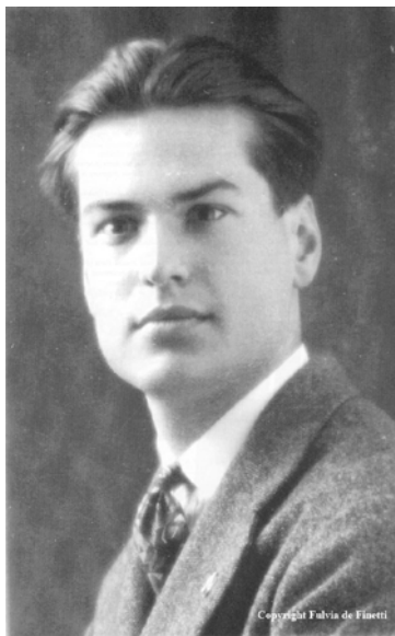
Bruno de Finetti (1906-1985)

Source: [ https://www.google.com/search?q=abraham+wald ].