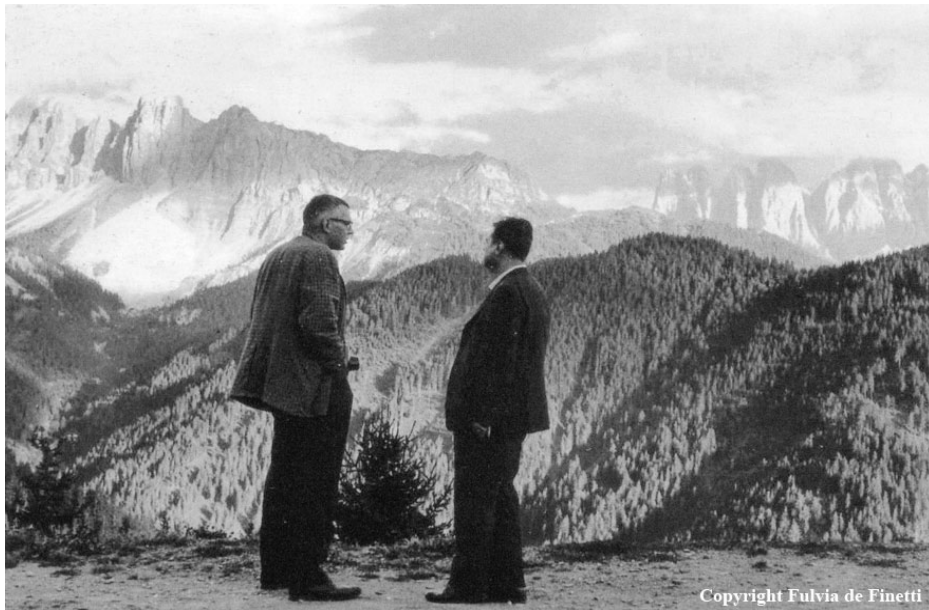
Bruno de Finetti and Leonard Jimmi Savage once again This is the precious “paparazzi-style trophy”: two giants (“quasi-opponents”) “caught” at the same time! (Bressanone Scientific Meeting, 1961)