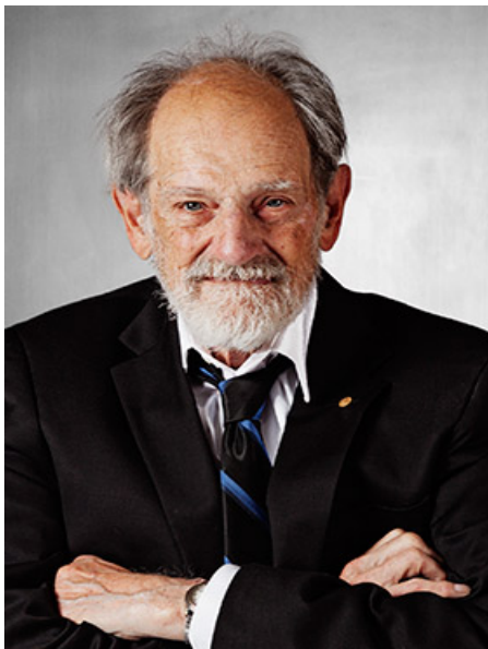
Lloyd Shapley (1923-2016)

estimated parameter as known). Contrary to this, empirical Bayes procedures perform in two-fold, simultaneous ways: subsequent coming (and gathered) information enriches the knowledge about the “really investigated” quantity and – at the same time – about the (unknown) distribution of the parameter (“mixed strategy” of Nature), on which depends the estimated value. It might be of some interest to note that “orthodox” Bayesians negate the above methodology from the fairly principal positions (philosophical as well as logical): they simply regard it as logically incorrect (Robbins himself was fully aware of the certain weakness of the “empirical Bayes” concept in this aspect) and treat its creator as a traitor while the idea as the “schism” (towards the “true Bayesianism”).