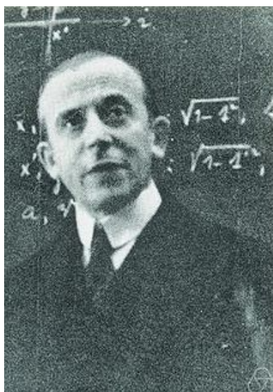
Richard von Mises (1883-1953)

Von Mises' approach to the foundations of probability are purely philosophical (despite his mathematical education and many valuable subjects in this area). His early, original work “Probability, Statistics, and Truth” [Mises 1928], developed the “correct”, objective, or “frequency” theory of probability . The central idea of the theory was the so-called “Kollektiv” ; it is worth noting that, years later, the main elements of this concept were accepted even by A. Kolmogorov [1965]. Similarly, in their seminal paper on the definition of probability (in a “Savagean wine”), Anscombe and Aumann [1963] combined two different meaning of uncertainties , which they termed “horse (logical) lotteries” and “roulette (physical) lotteries”, respectively: one-time (disposable) and repeatable. Thus both of the above “kinds of chance” turn out to be “real and reasonable” and have to be taken into account when a behavior under risk is considered .