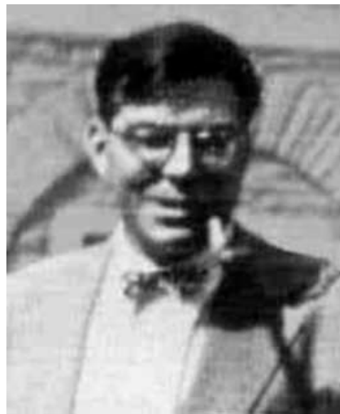
Leonard Jimmie Savage (1917-1971)

Source: [ https://www.google.com/search?q=bruno+de+finetti ; https://www.google.com/search?q=leonard+jimmie+savage ].