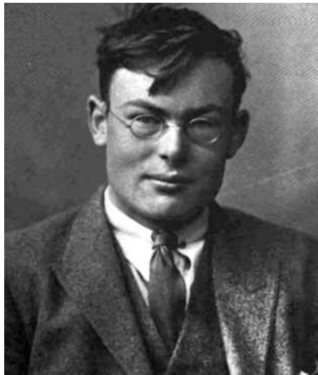
Frank Plumpton Ramsey (1903-1930)

Source: [ https://en.wikipedia.org/wiki/Frank_P._Ramsey ].