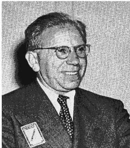
Abraham Wald (1902-1950)

Source: [ https://www.google.com/search?q=abraham+wald ].