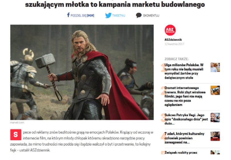
Phot. 1. A specific comment to the "Polish boy wanted" campaign

Internauci znów dali sie nabrać. Film o chłopaku